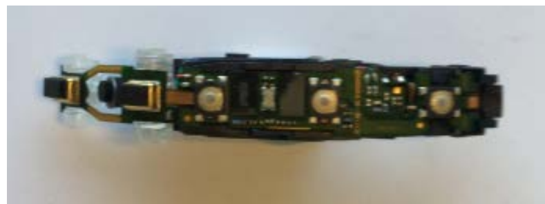
Radio module from the top side (button side)