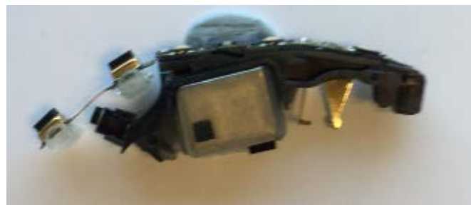
Radio module from the side

NB: The regulatory label is not shown on the radio module itself or any end products with it, since they are too small for the label to be readable without any optical aids or magnification. Below the radio module is shown, indicating a size of about 10x15x45 mm.