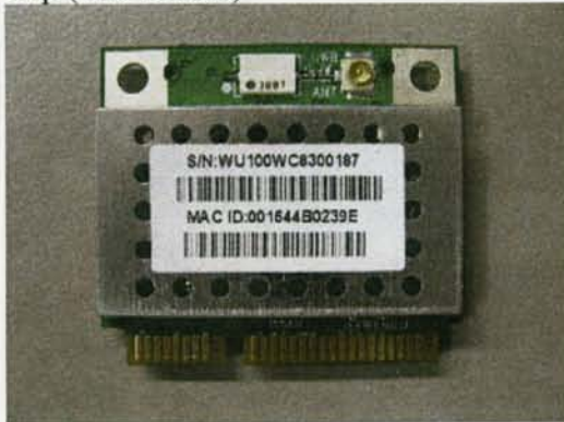
WiQuest HMC Module PCB assembly Top (with Shield)