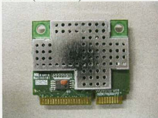
WiQuest HMC Module PCB assembly Bottom (with Shield)