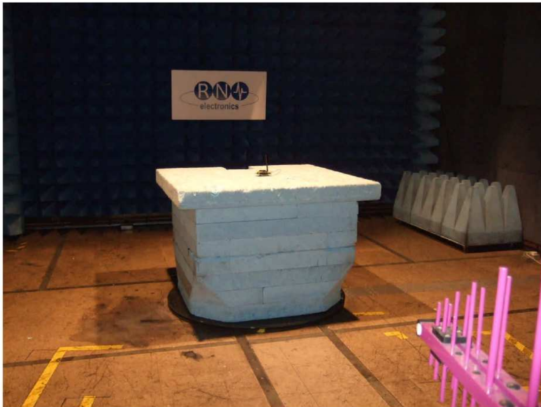
Photograph of the EUT as viewed from in front of the antenna, site M.