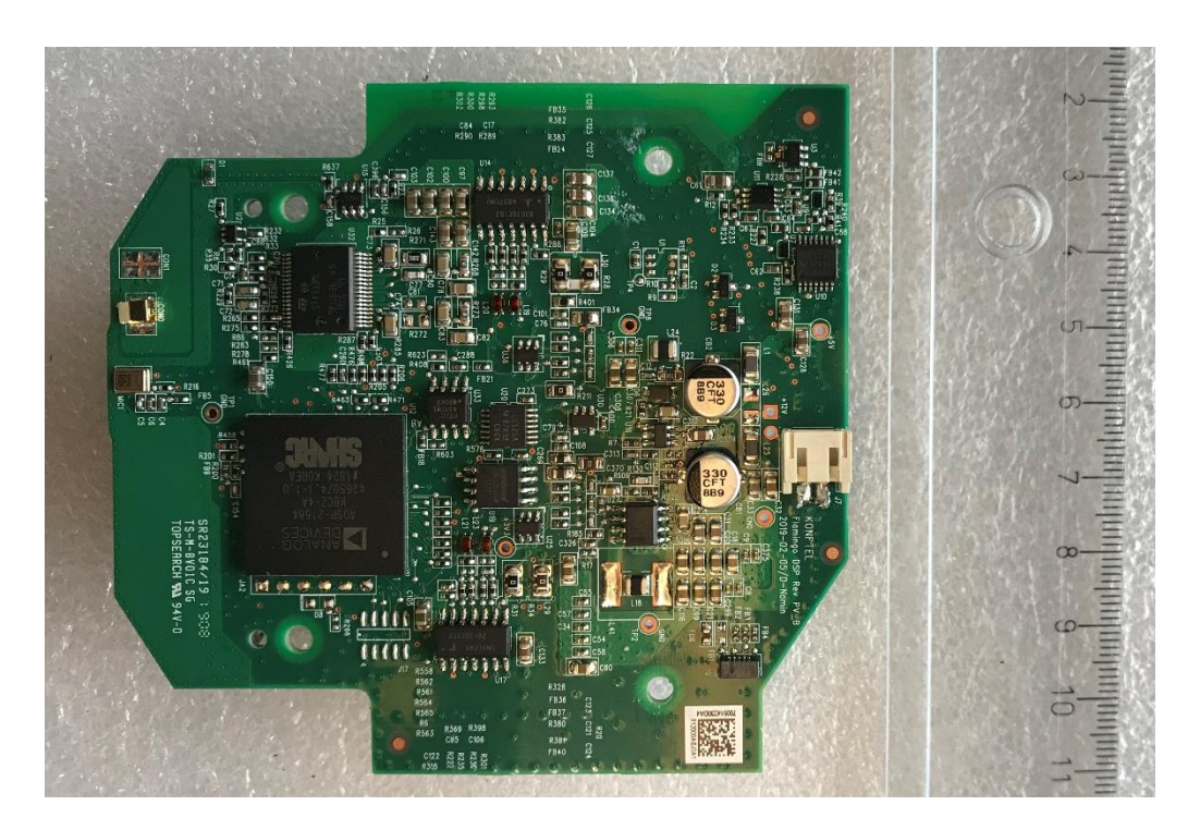
DSP PCB top view