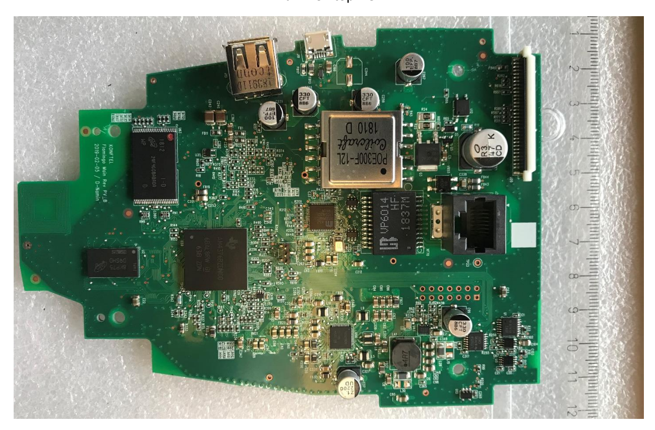
Main PCB bottom view