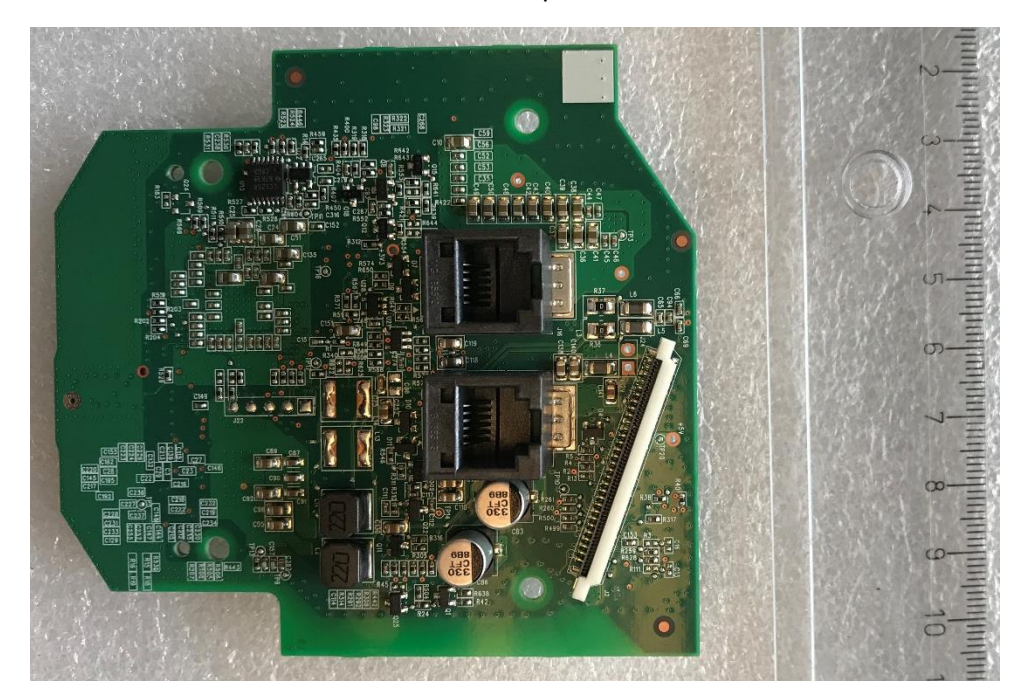
DSP PCB bottom view