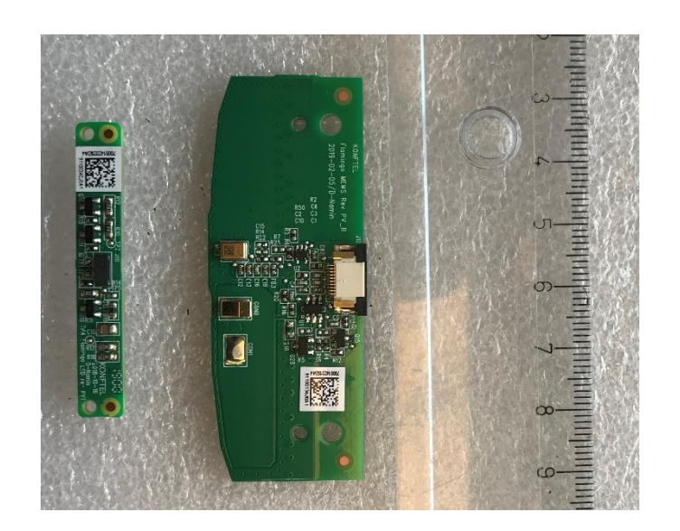
MEMS and LED PCBs top view