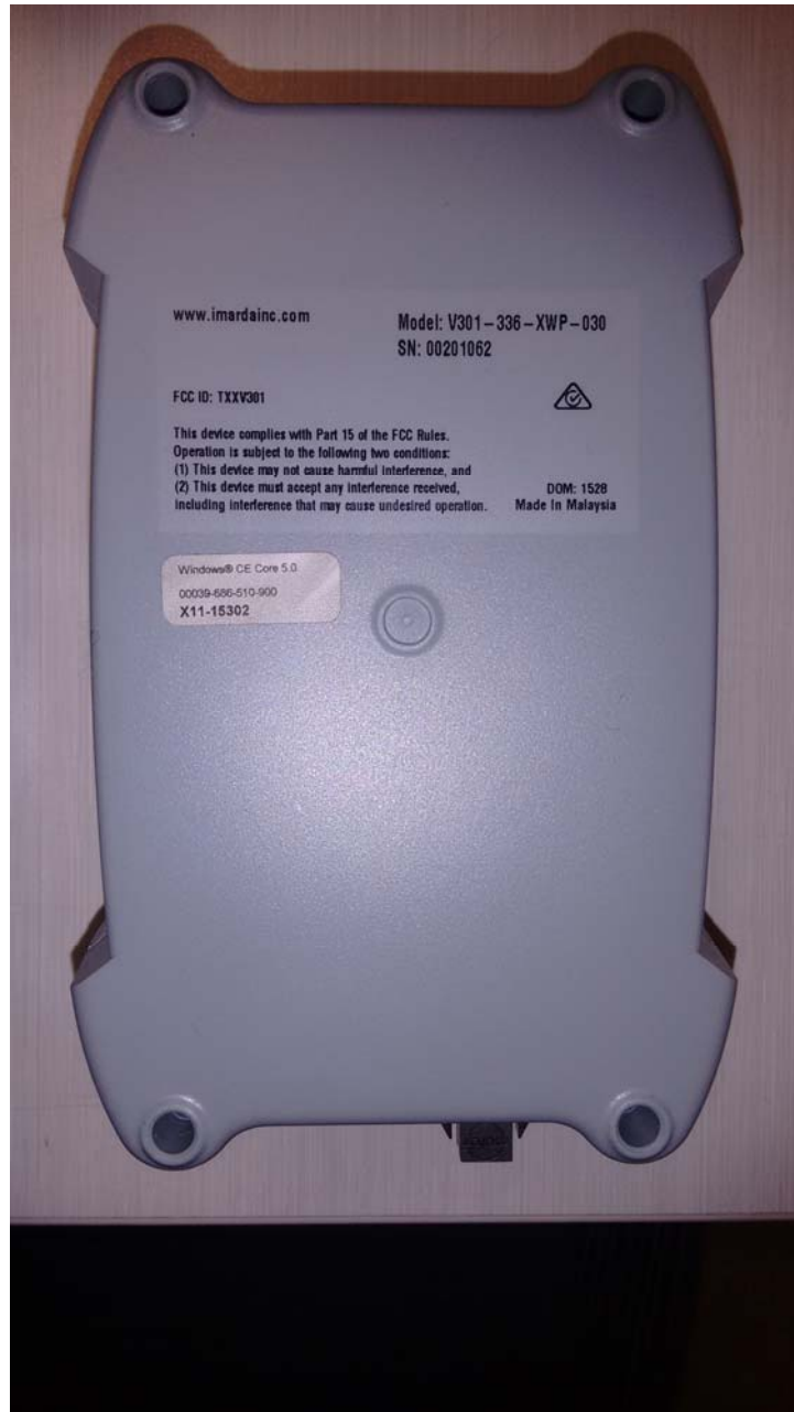
FCC Label & Location on XWP Base Bottom

This document shall not be reproduced, except in full