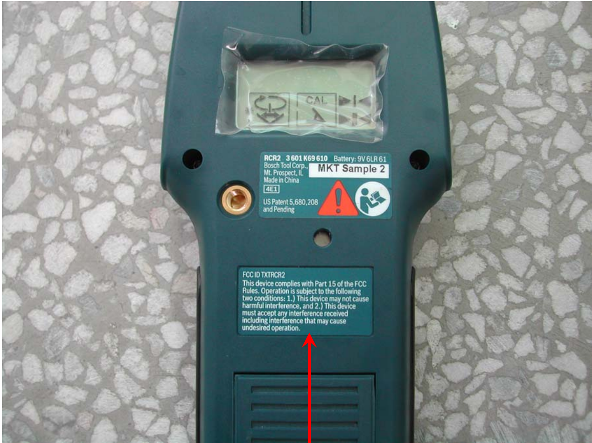
FCC label location