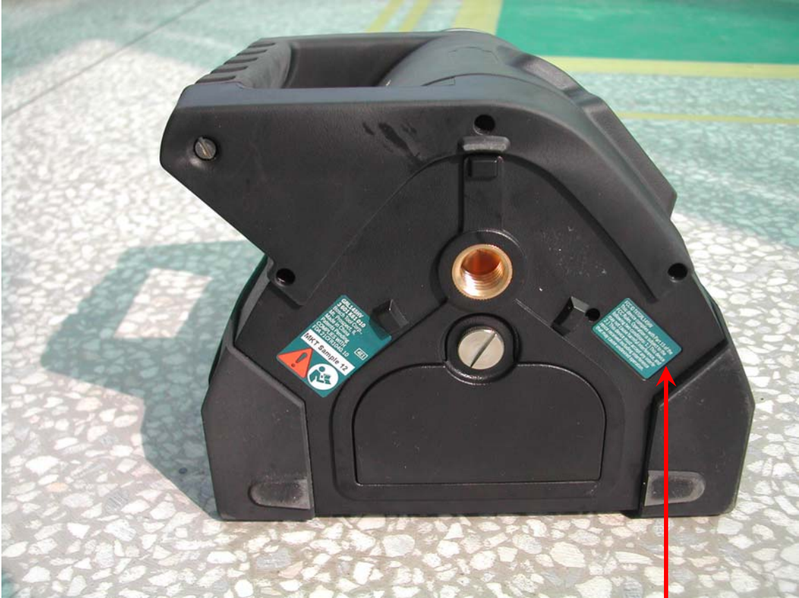
FCC label location