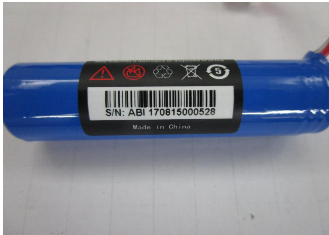
Photograph 6: EUT Battery Serial Number