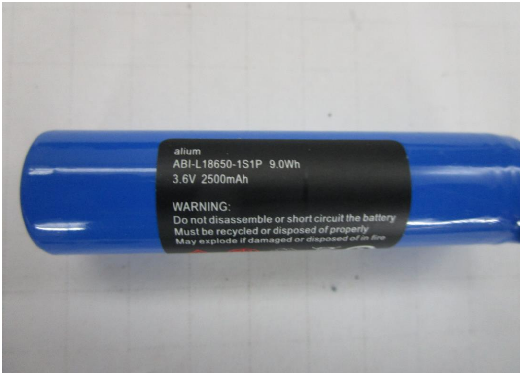
Photograph 5: EUT Battery Type