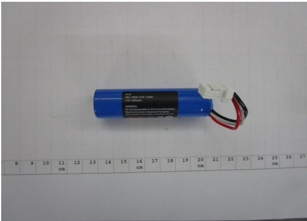
Photograph 4: EUT Battery