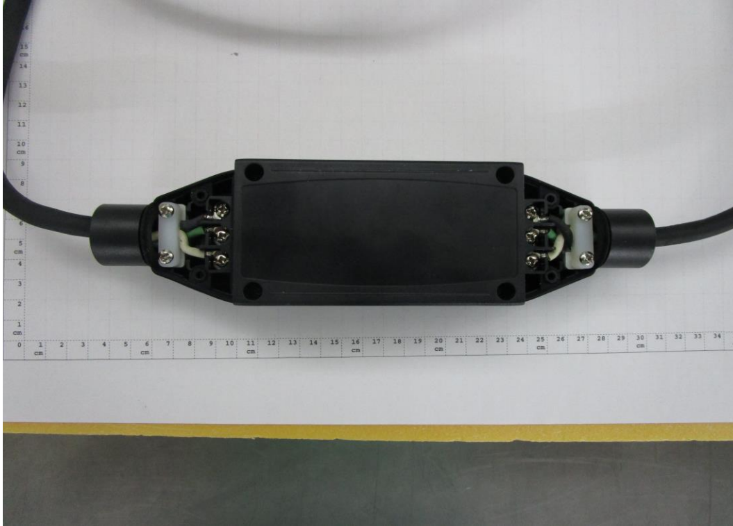
Photograph 1: EUT Inside