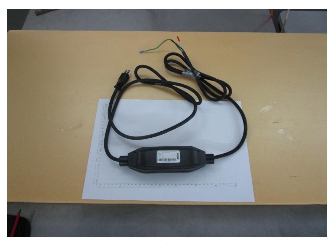
Photograph 1: Equipment under Test(EUT) with Harness