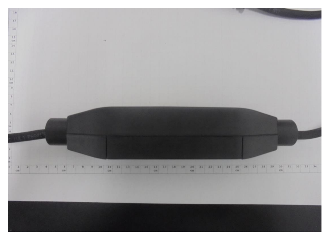
Photograph 4: EUT_Front side view