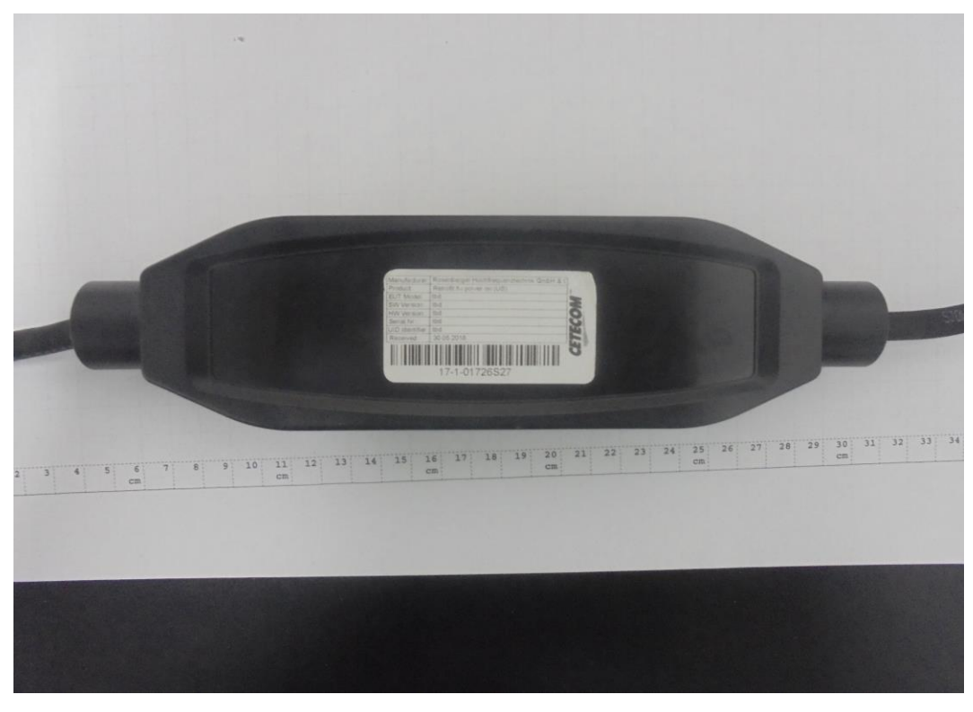
Photograph 3: EUT_Top side view