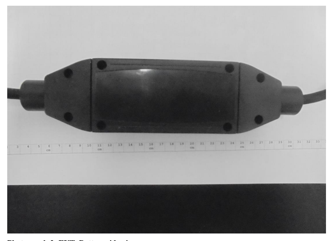
Photograph 2: EUT_Bottom side view