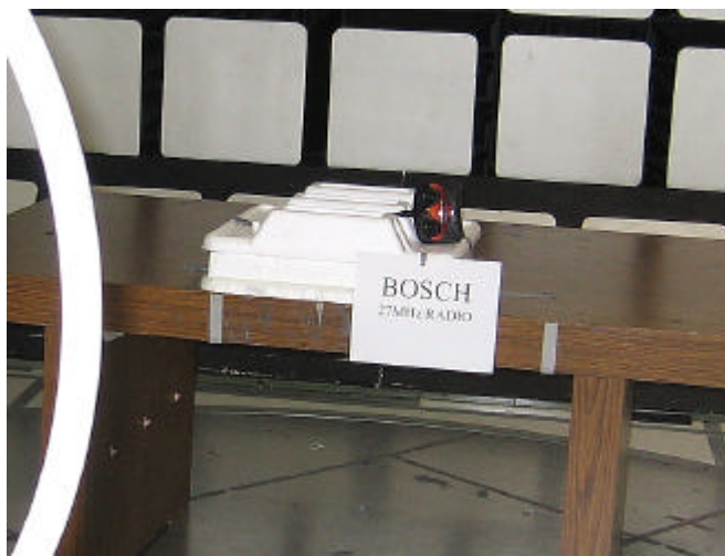
Radiated Emissions Y-Axis