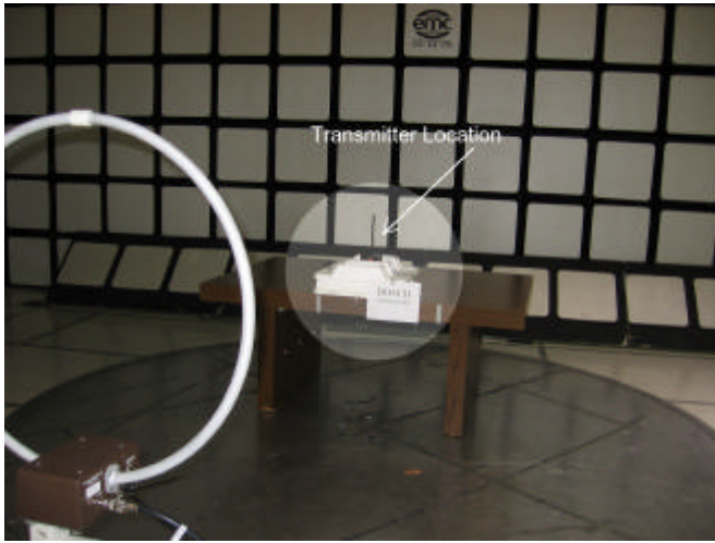
Radiated Emissions Transmitter Location X-Axis