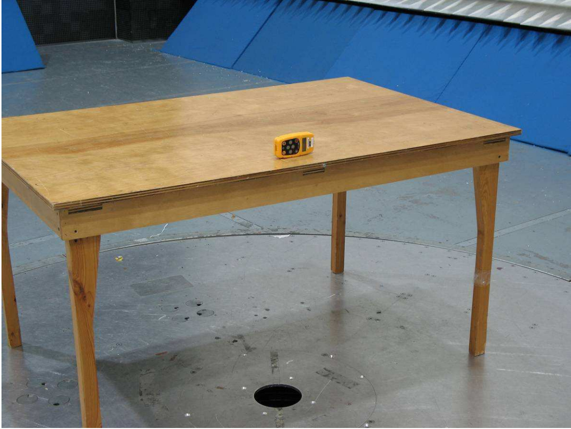
Orthogonal Configuration (Side)