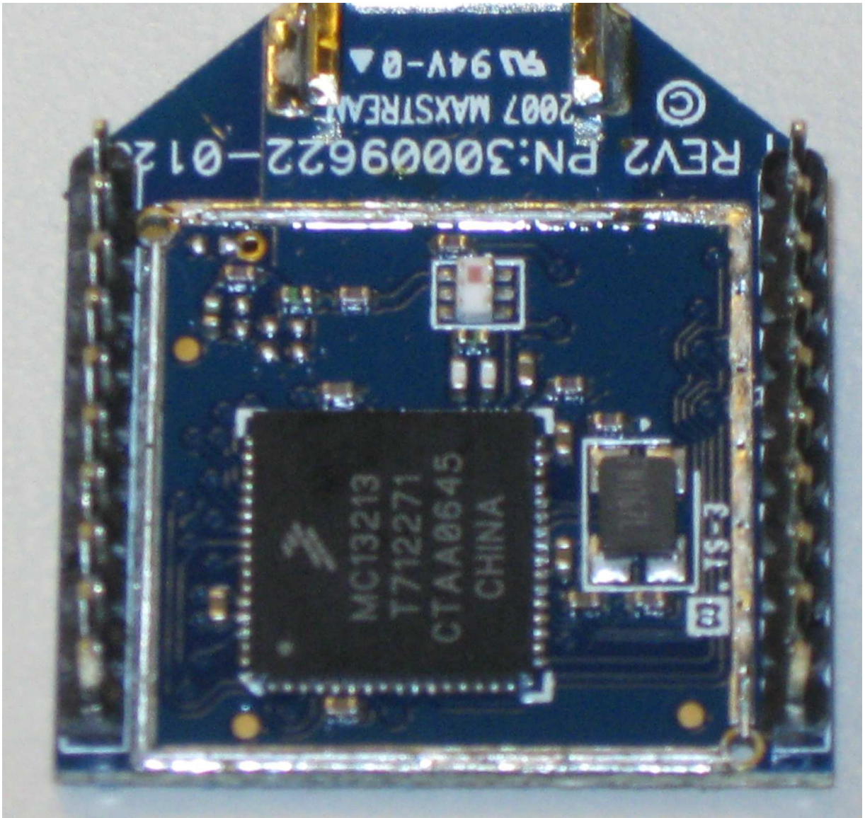
Transmitter Module with Shield Removed