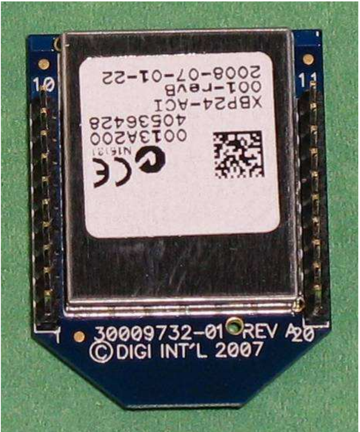
Back Side of Transmitter Module