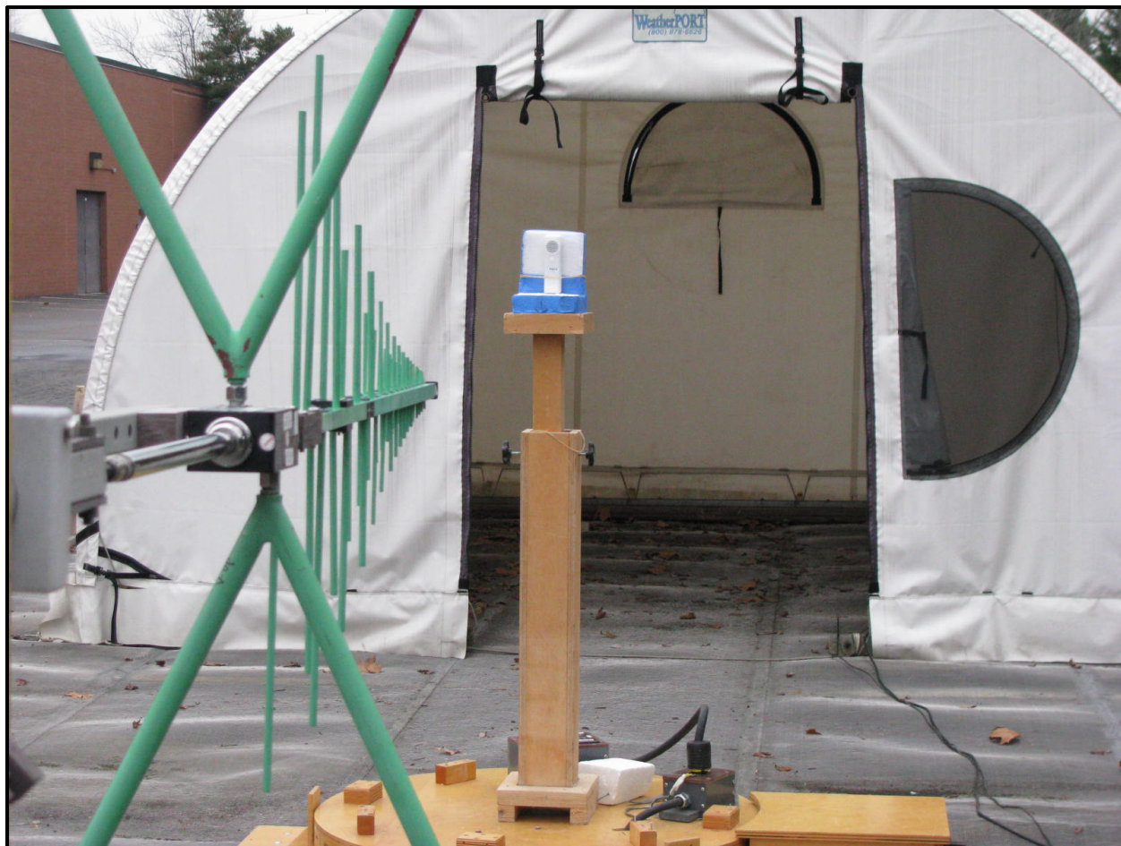
Photograph 1: Radiated Emissions X-Axis