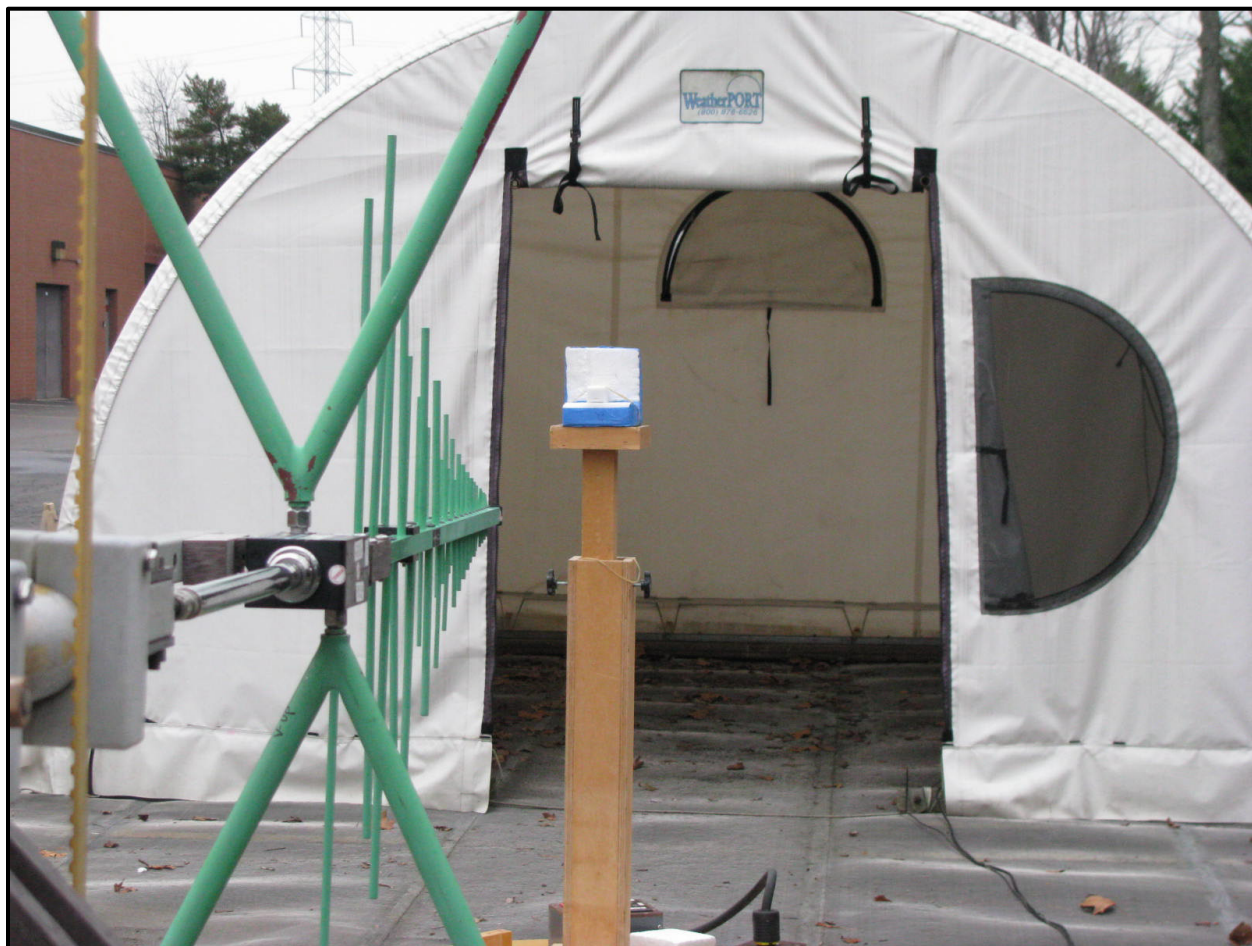
Photograph 2: Radiated Emissions Y-Axis