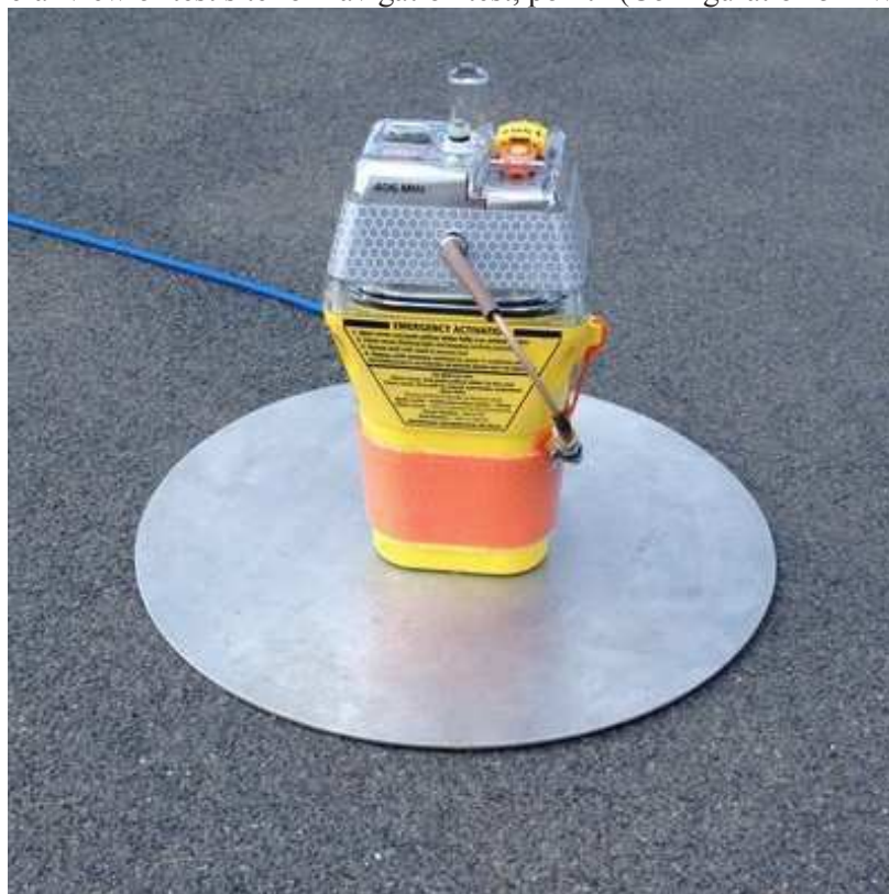
Fig. 5.10.2 — General view of test site for navigation test, point 1 (Configuration 7 – Beacon on ground plan).