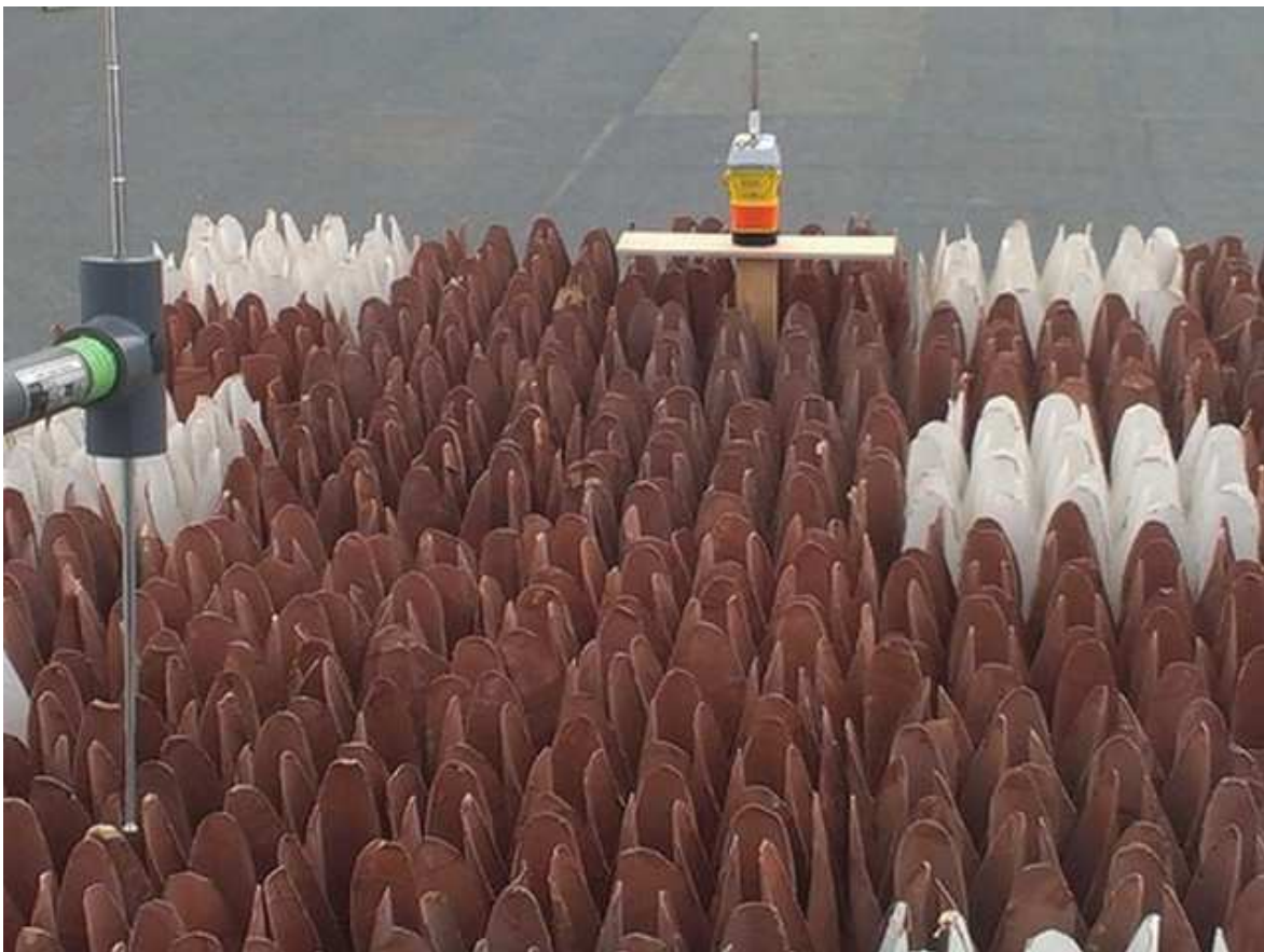
Fig 5.10.8 — General view of antenna test place at configuration 4 (section 4.5 C/S T.007) (beacon operating above ground plane).