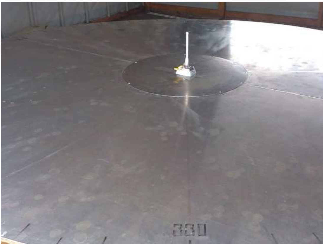
Fig 5.10.7 — General view of antenna test place at configuration 1 (section 4.5 C/S T.007) (beacon operated on «water» ground plane).