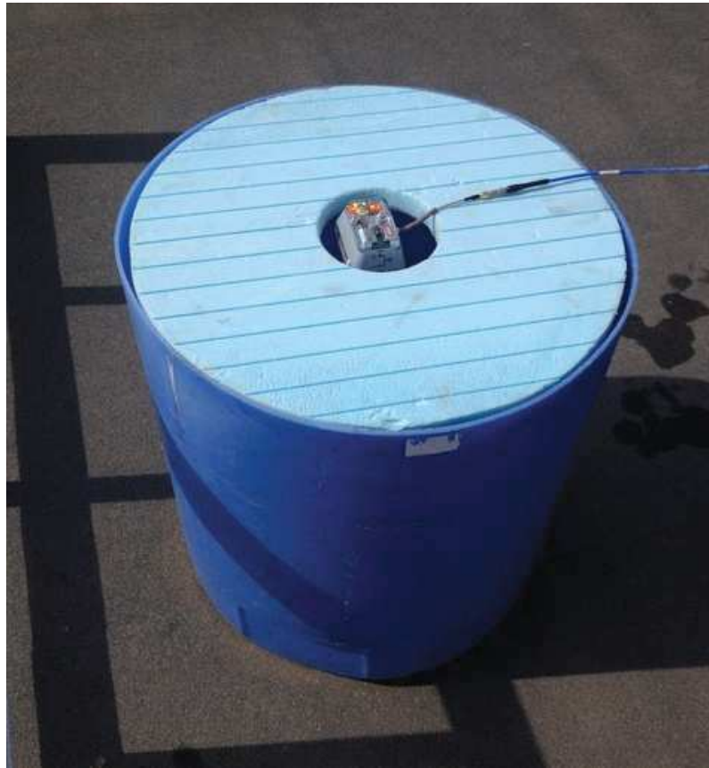
Fig. 5.10.1 — General view of test site for navigation test, point 1 (Configuration 5 – Water ground plane).