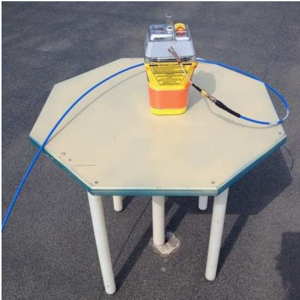
Fig. 5.10.3 — General view of test site for navigation test, point 1 (Configuration 8 - Beacon above ground plane).