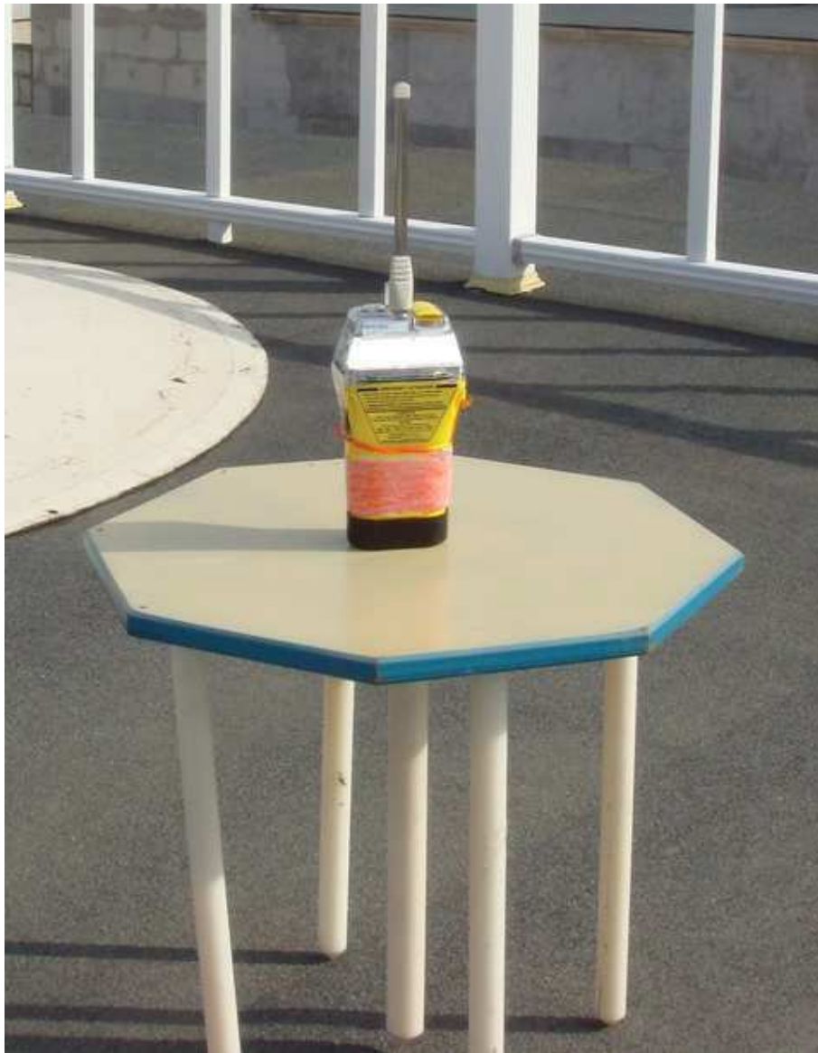
Fig 5.10.6 — General view of test site during satellite qualitative test at configuration 8 (section 4.5 C/S T.007).