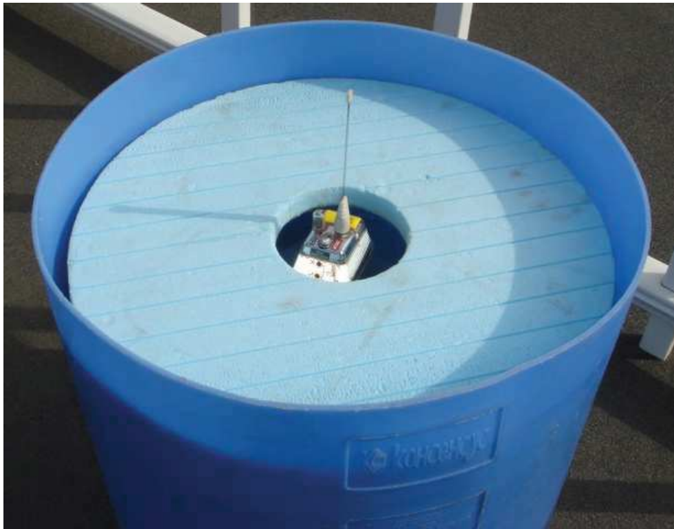
Fig. 5.10.4 — General view of test site during satellite qualitative test at configuration 5 (section 4.5 C/S T.007).