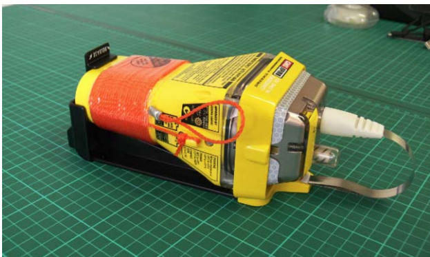
Picture 5 - MT403G in manual release bracket