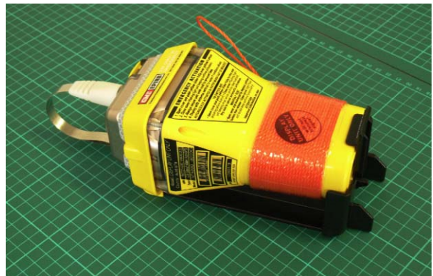
Picture 6 - MT403G in manual release bracket