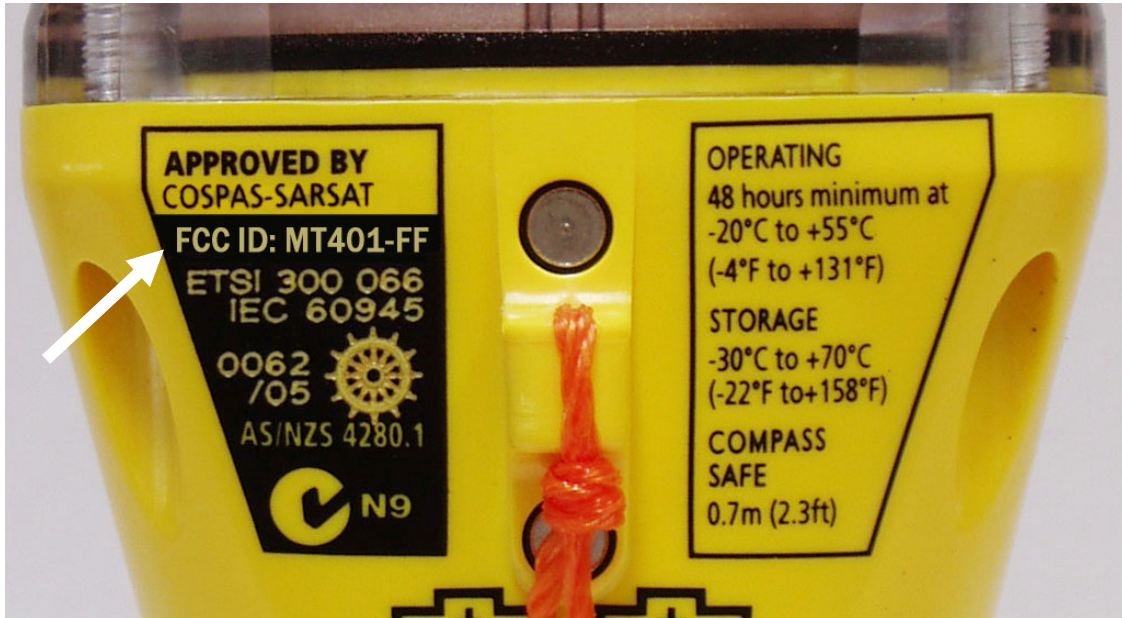
Figure 1 - Close View

It is intended to include the FCC ID with other similar information on the left hand side of the beacon. It will either be laser engraved into the black to show text in relief as yellow (as shown), or printed as black text directly onto the yellow substrate.