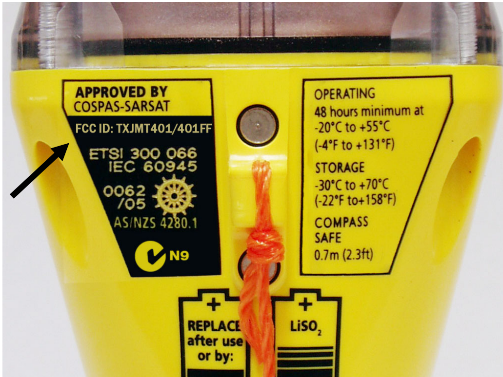
Figure 1 - Close View

It is intended to include the FCC ID with other similar information on the left hand side of the beacon. It will either be laser engraved into the black to show text in relief as yellow (as shown), or printed as black text directly onto the yellow substrate.