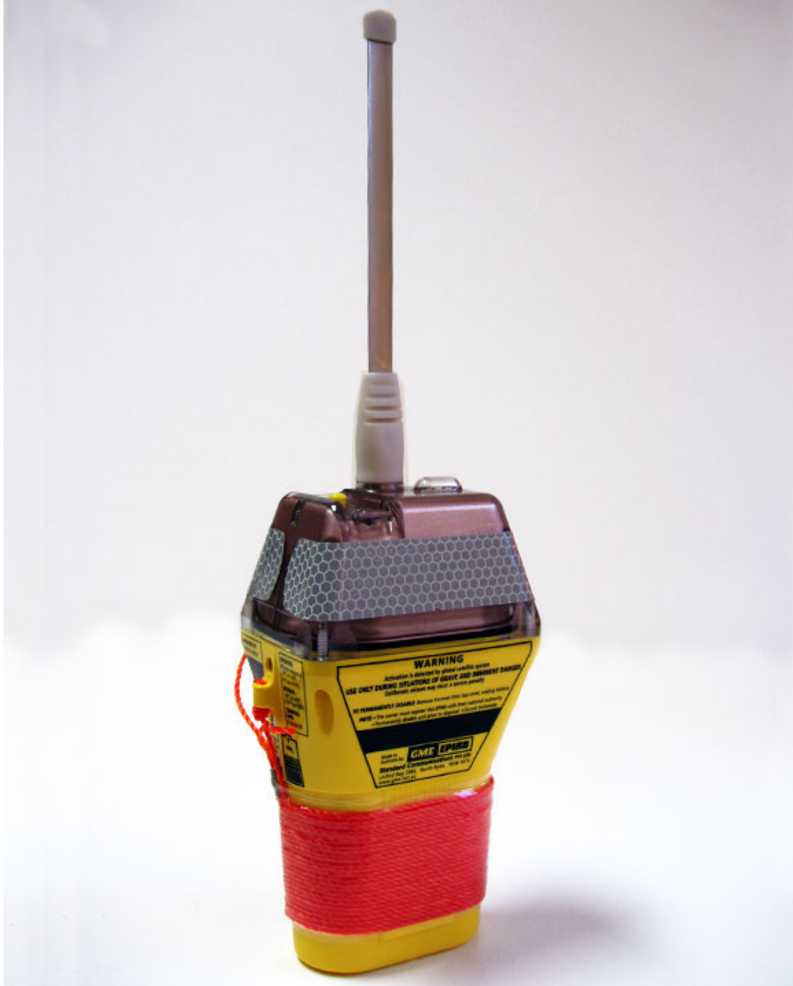
Figure 2 - MT401 perspective 2 (rear)