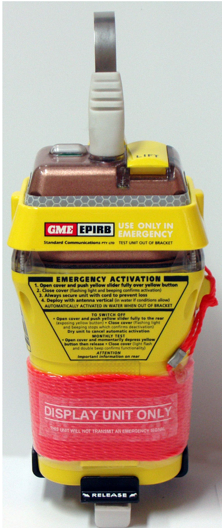
Figure 8 - MT401 in manual release bracket (No.2)