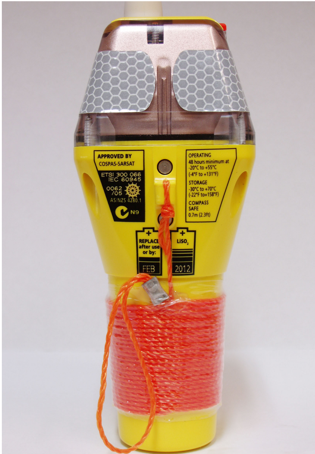
Figure 6 - MT401 - right view (existing)

NOTE: Top left text frame to be modified to incorporate FCC ID information. Please refer to submission document relating to FCC ID marking.