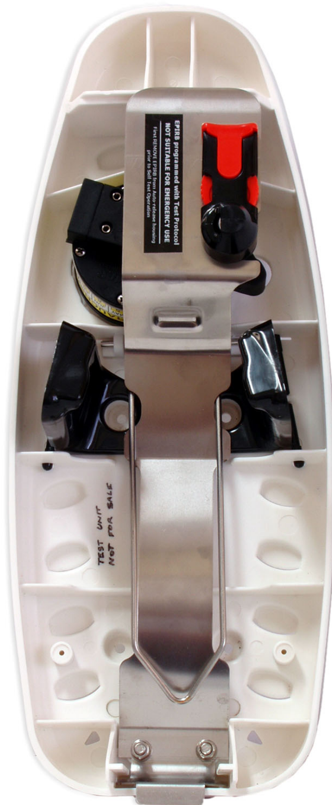
Figure 10 - MT401FF Auto release housing (base)