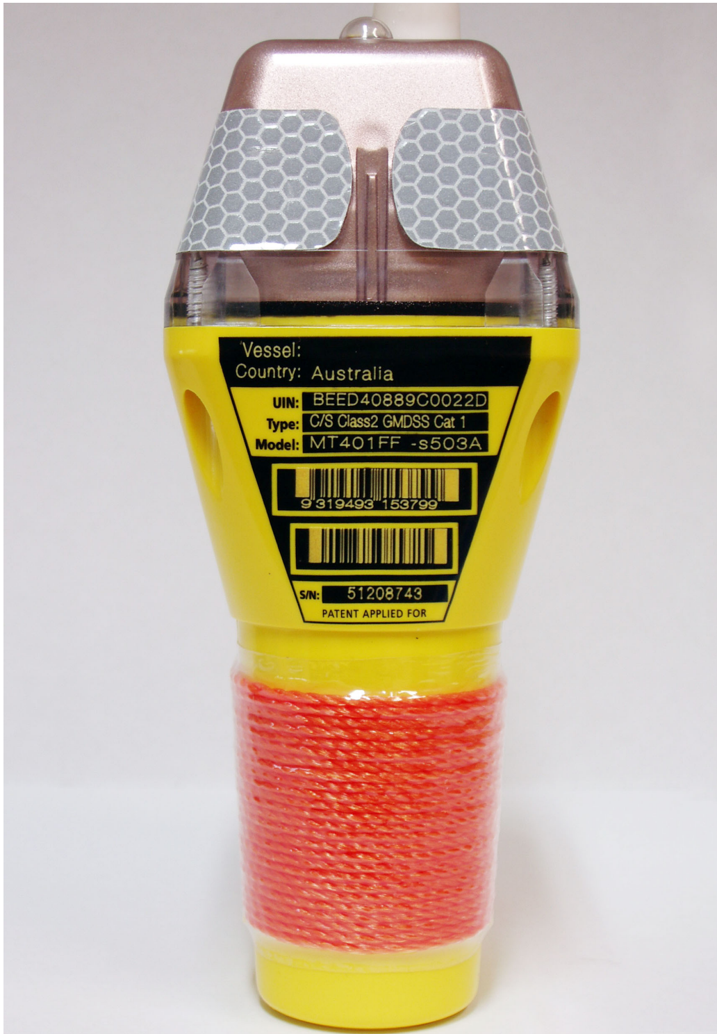
Figure 5 - MT401 left view