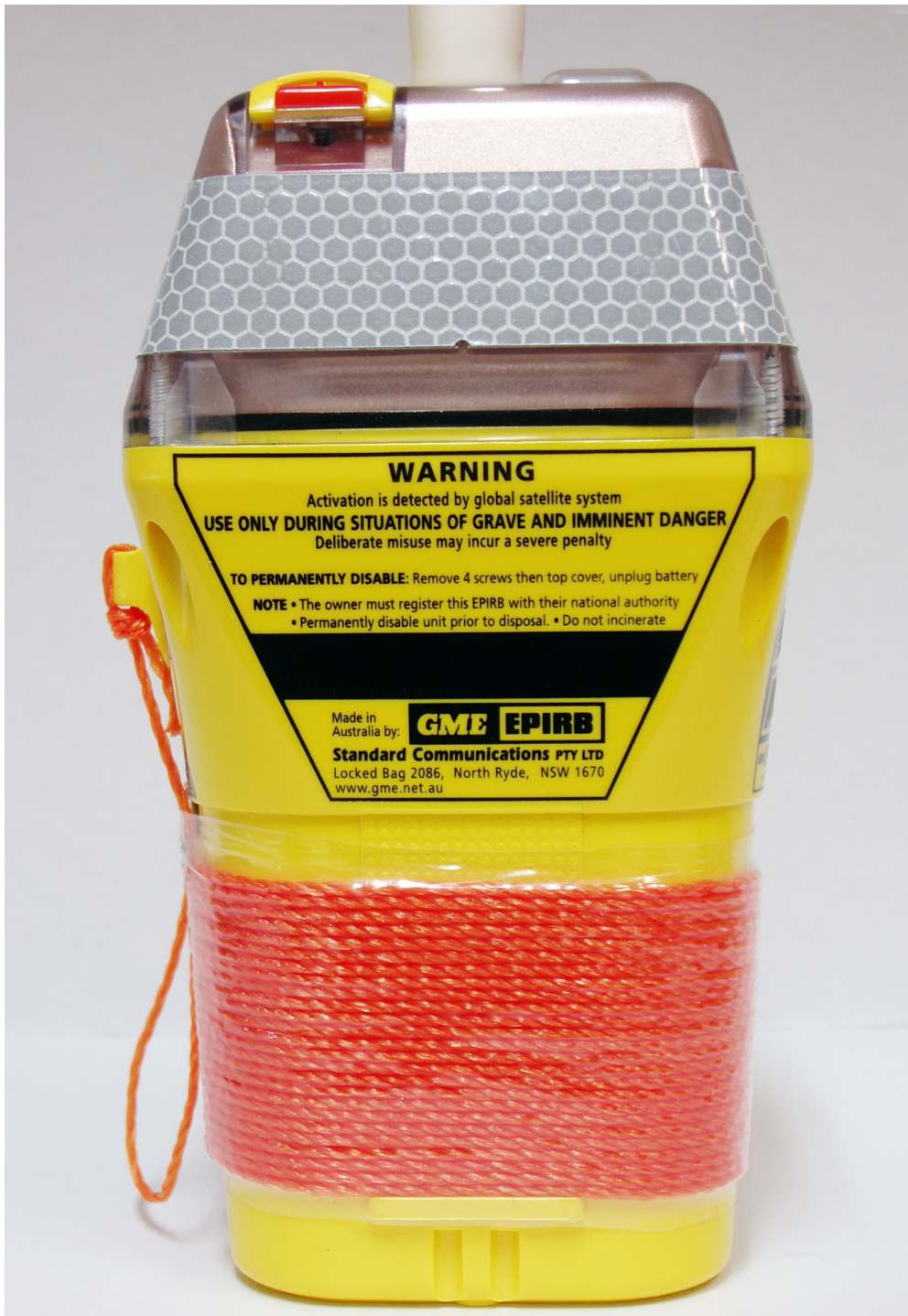
Figure 4 - MT401 rear view