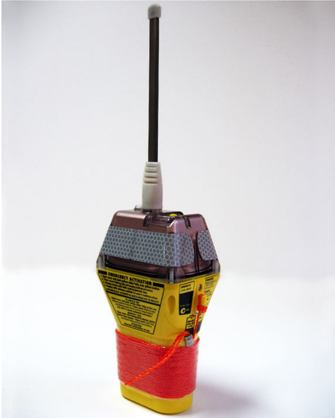
Figure 1 - MT401 perspective 1 (front)