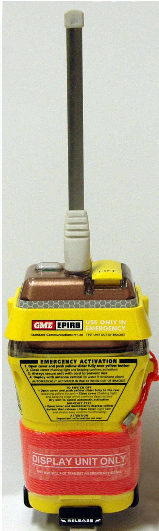
Figure 7 - MT401 in manual release bracket (No.1)