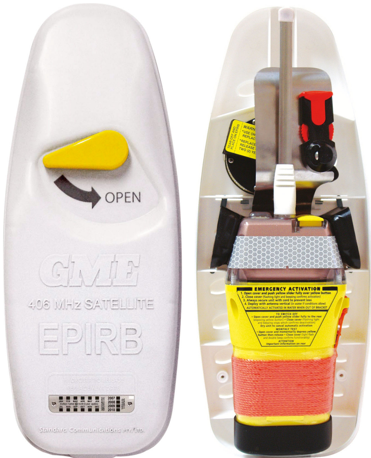
Figure 9 - MT401FF, complete (MT401 fitted in auto-release housing)

NOTE: Black plastic adapter plate is fitted to the base of the MT401 when used in this configuration.