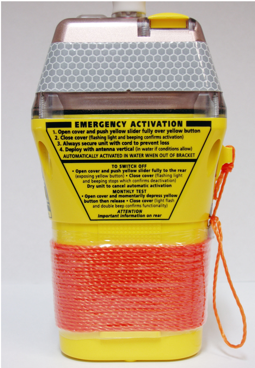
Figure 3 - MT401 front view