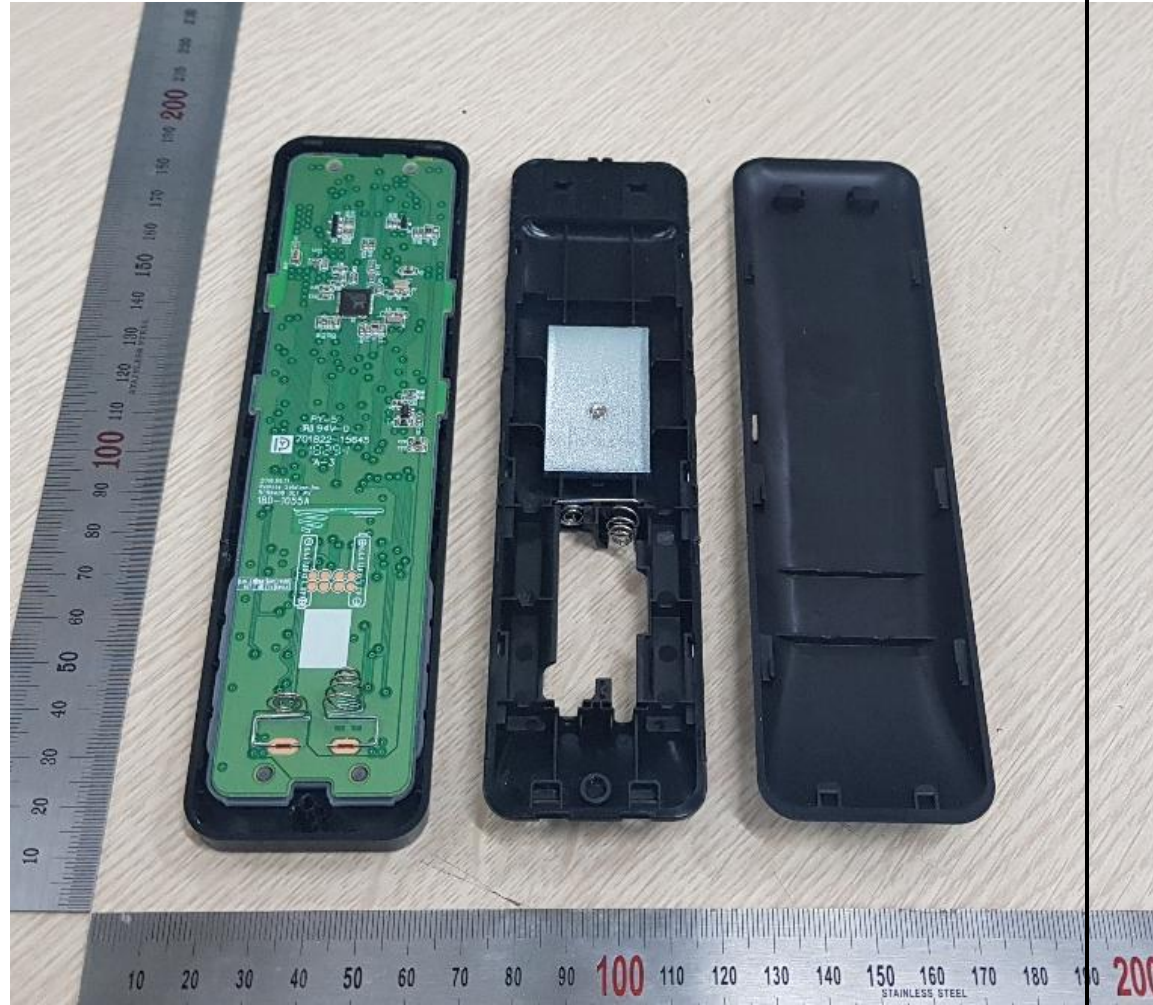
Cover off view