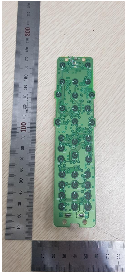
PCB - Rear View