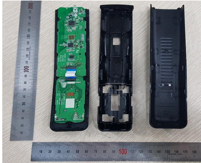
Cover off view