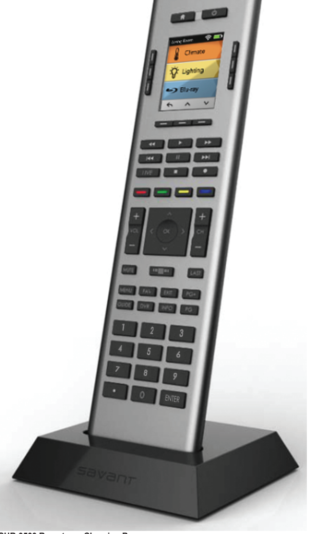
SUR-0500 Remote on Charging Base

Le présent appareil est conforme aux CNR d'Industrie Canada applicables aux appareils radio exempts de licence. L'exploitation est autorisée aux deux conditions suivantes: (1) l'appareil ne doit pas produire de brouillage, et (2) l'utilisateur de l'appareil doit accepter tout brouillage radioélectrique subi, même si le brouillage est susceptible d'en compromettre le fonctionnement.