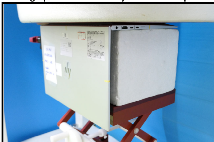
Bottom of EUT Tested at 0 mm