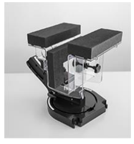
Mounting Device for Laptops

The extension is lightweight and made of POM, acrylic glass and foam. It fits easily on the upper part of the mounting device in place of the phone positioned. The extension is fully compatible with the SAM Twin and ELI phantoms.