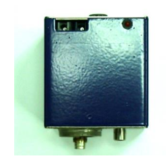
Fig 5.1 Photo of DAE

The input impedance of the DAE is 200 MOhm; the inputs are symmetrical and floating. Common mode rejection is above 80 dB.