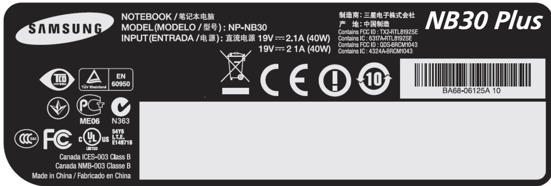
Bottom of the Host