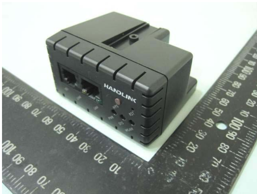
EUT with Black case