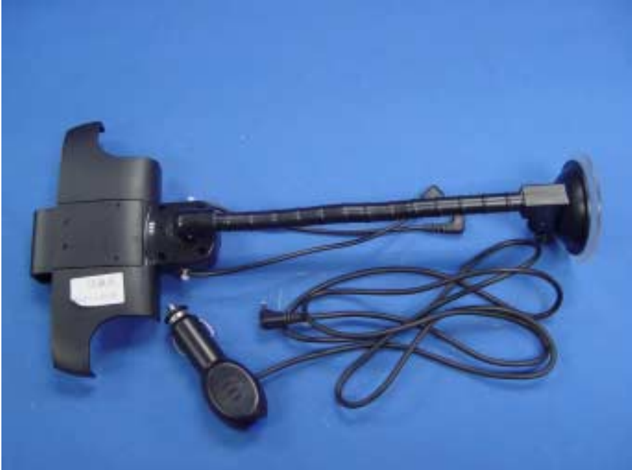
Figure 1 General Appearance