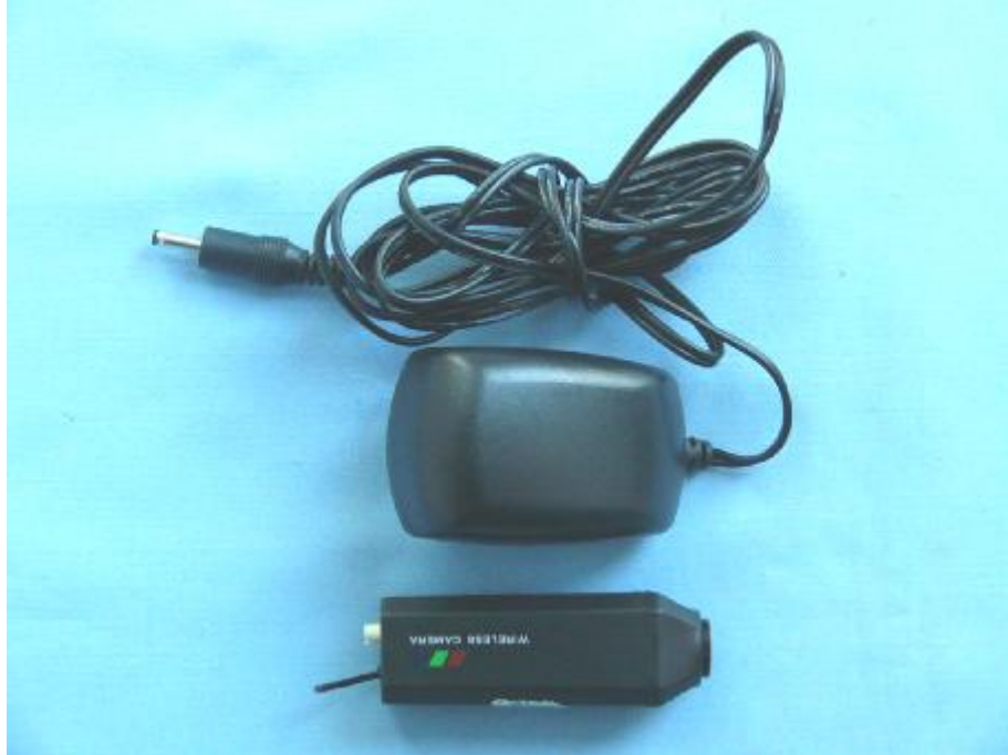
EUT top view

Applicant: Shenzhen Gopell Smarthome Electronic Co., Ltd. FCC ID: TW5GP-830T