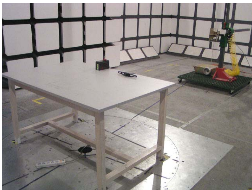
Above 1 GHz: Radiated Emission - Rear View