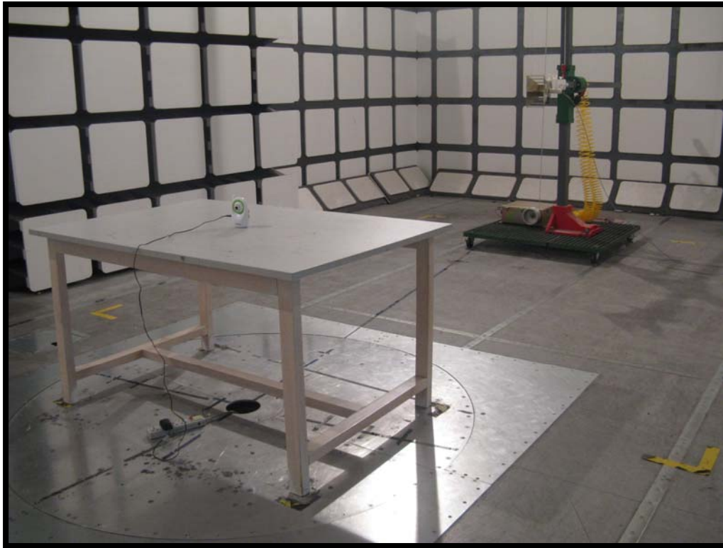
Radiated Emissions - Rear View (Above 1000 MHz)