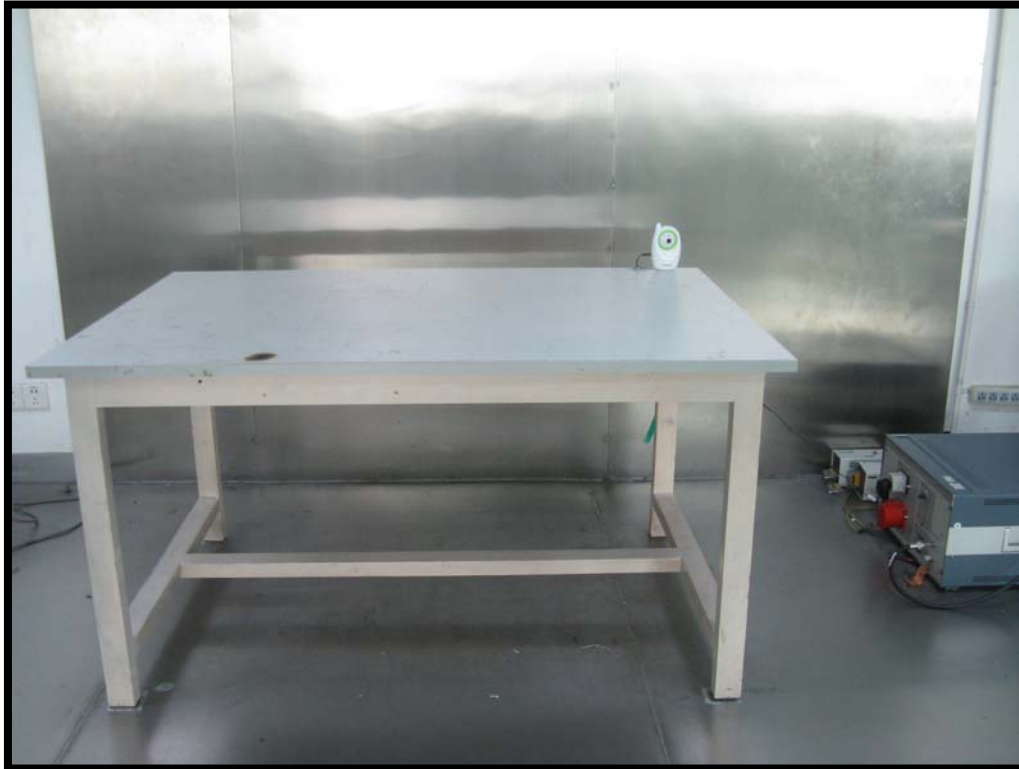
Conducted Emissions – Side View