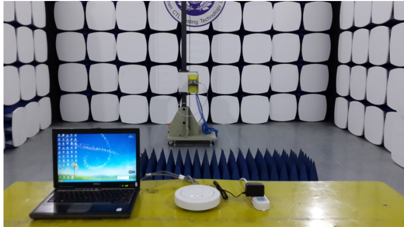
AC power line conducted emission