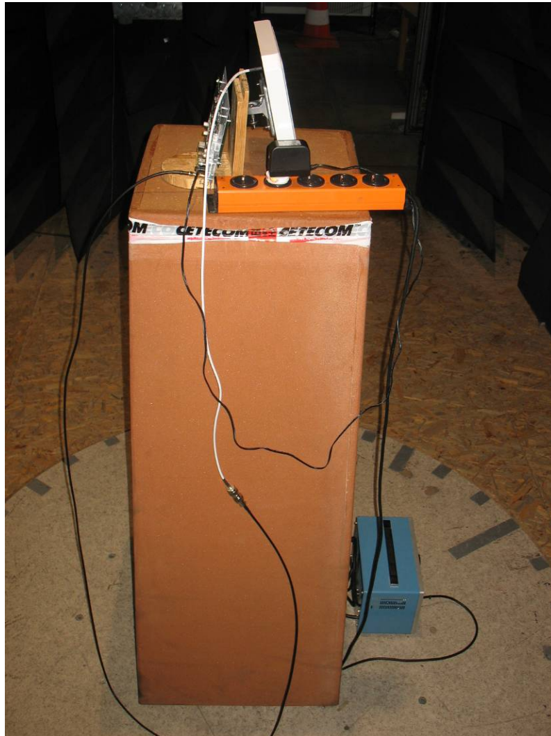
Radiated spurious emissions from 1 - 12 GHz in test chamber