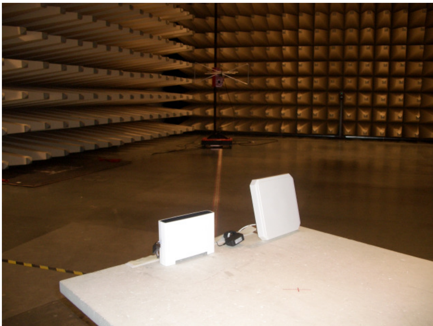
Anechoic chamber with 10m measurement distance