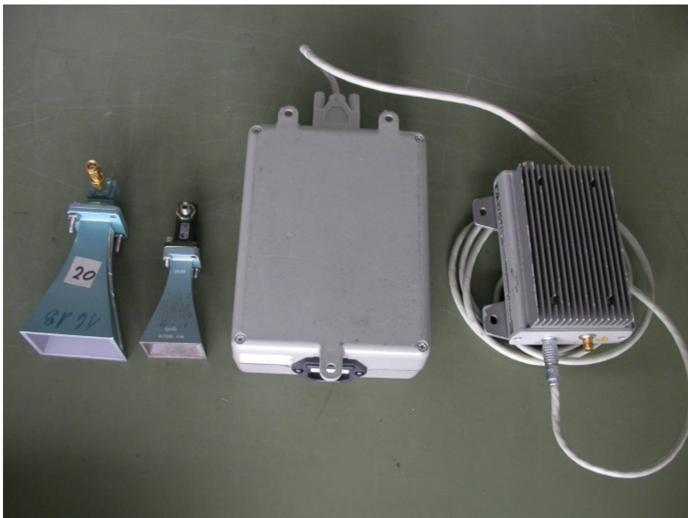
Equipment for spurious emission measurement from 12 GHz to 27 GHz