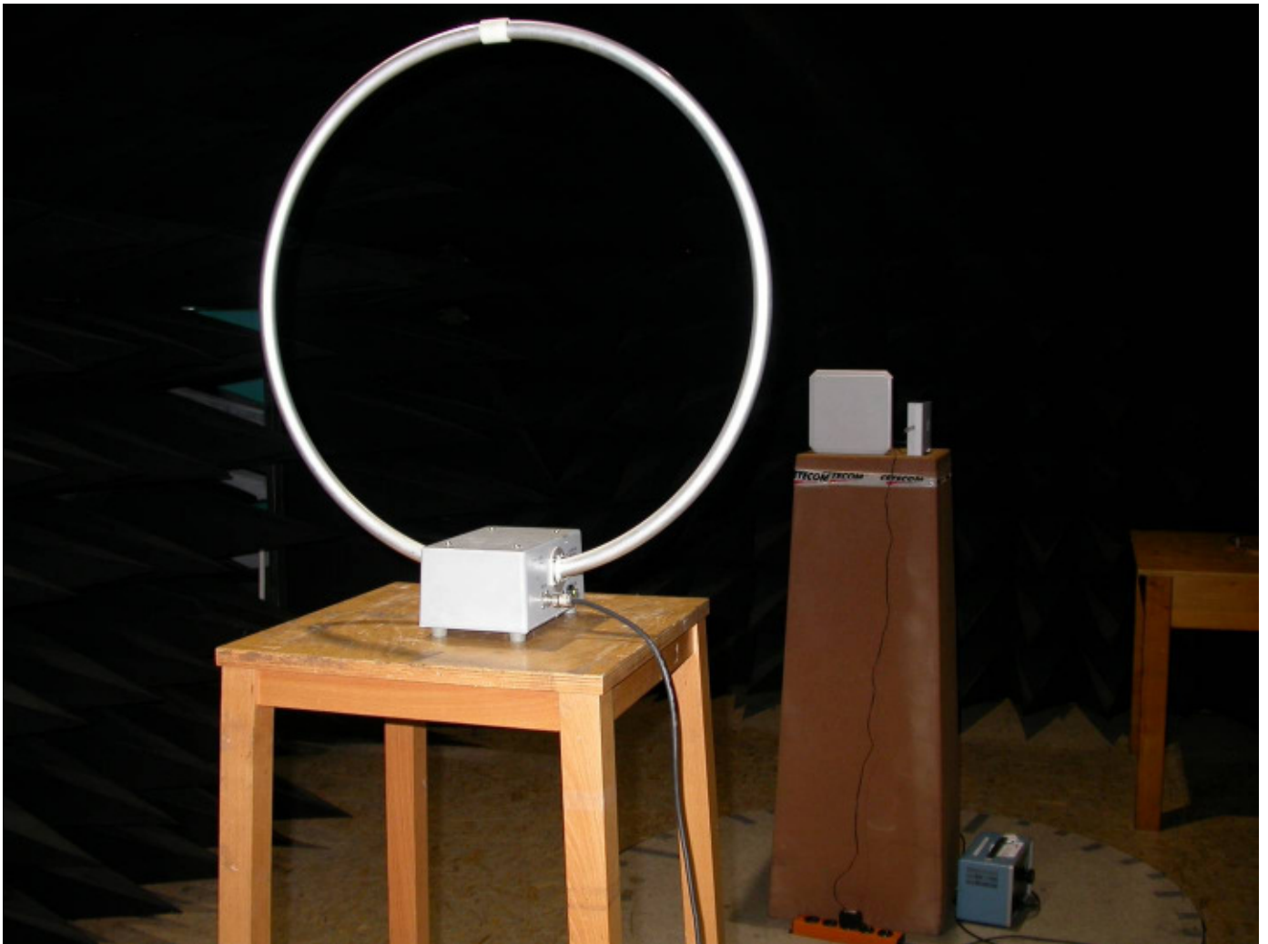
Spurious emissions from 9 kHz to 30 MHz