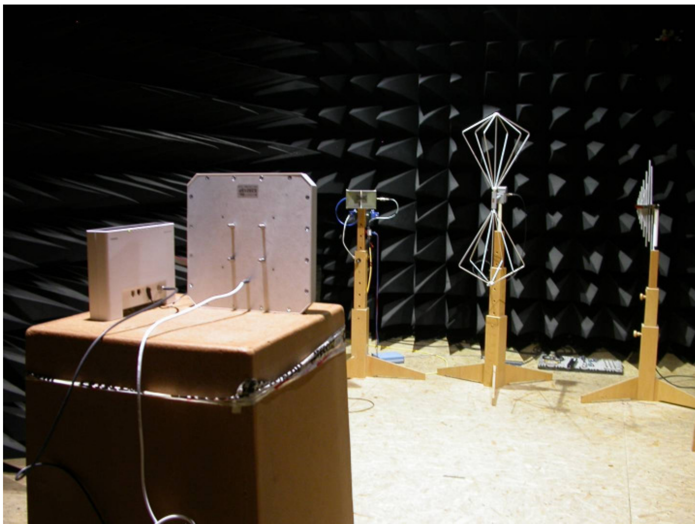
Spurious emissions from 30 MHz to 12 GHz