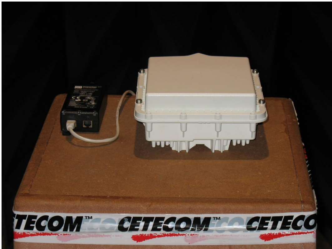
Radiated spurious emissions from 1 - 12 GHz in test chamber