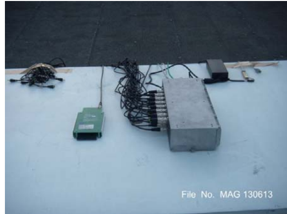
Radiated Disturbance Test Setup (15.209)