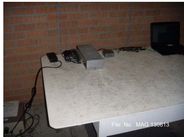
Conducted Disturbance (Dummy Load) Test Setup

This document shall not be reproduced, except in full