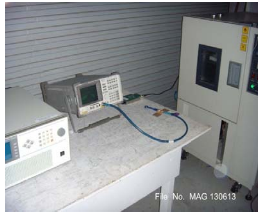
Frequency Stability Test Setup – (15.225)

This document shall not be reproduced, except in full