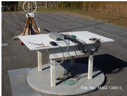
Radiated Disturbance Test Setup Below 30MHz – (15.209)