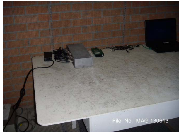
Conducted Disturbance (Antenna) Test Setup