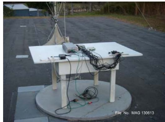
Radiated Disturbance Test Setup – 30 – 1000MHz (15.209)

This document shall not be reproduced, except in full