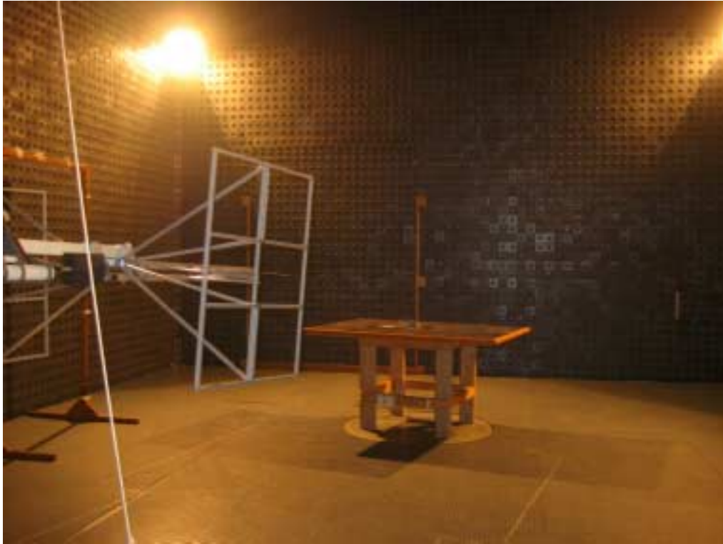
Photograph No.1 Setup for spurious emission field strength measurements in 30 MHz to 1 GHz range in the anechoic chamber