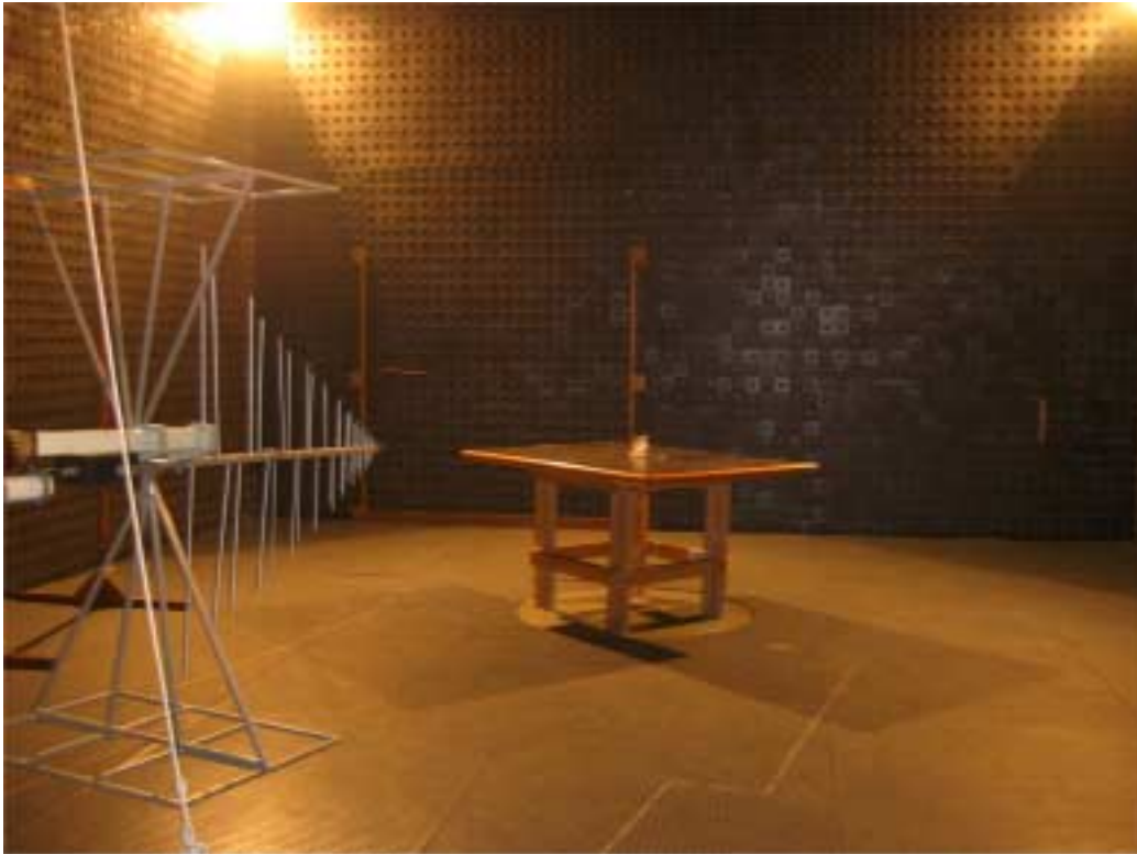
Photograph No.1 Setup for spurious emission field strength measurements in 30 MHz to 1 GHz range in the anechoic chamber