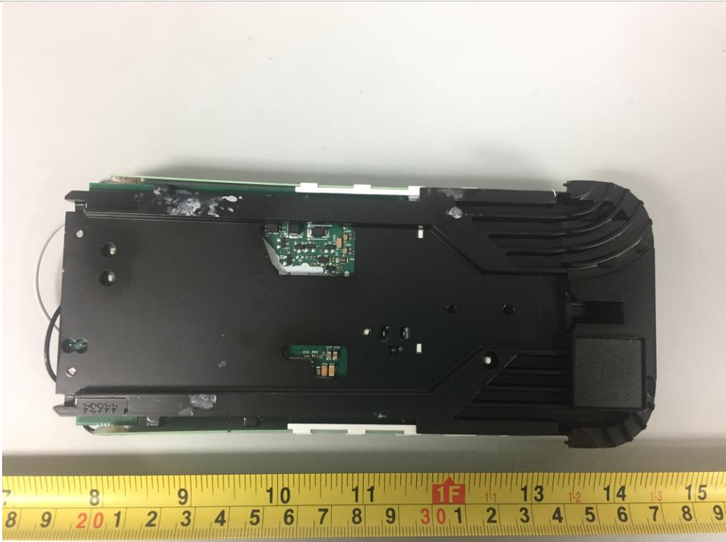
EUT Cover Off View-Bottom