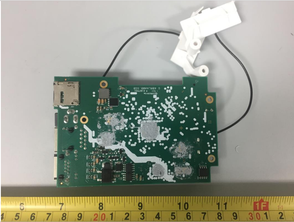
Main PCBA -Bottom