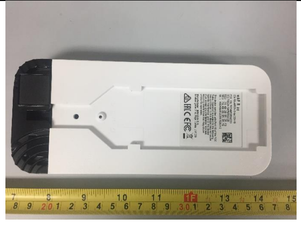
EUT Bottom View