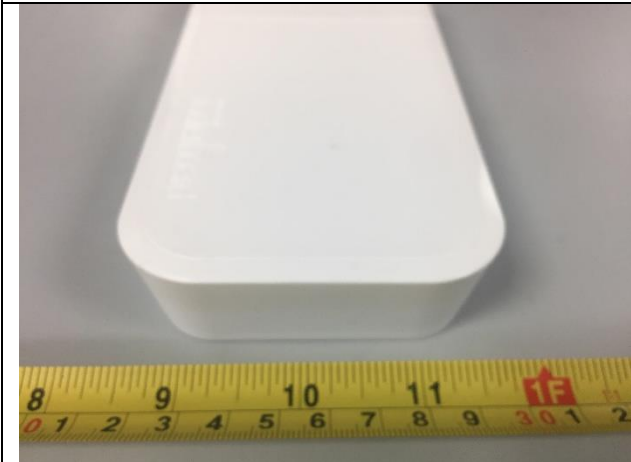
EUT Front View