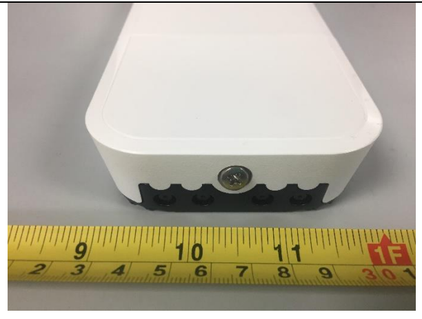
EUT Rear View