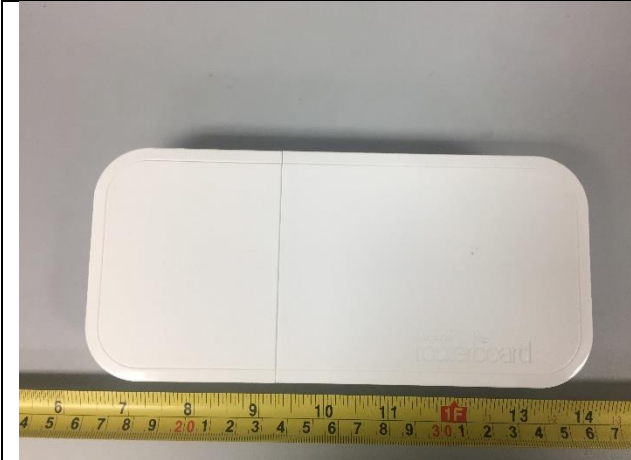
EUT Top View