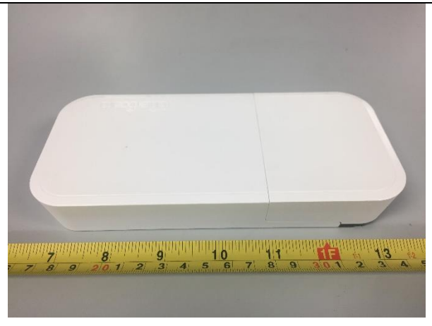
EUT Right View