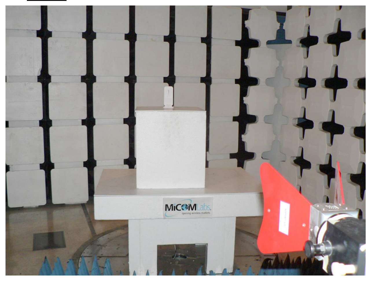
TX Spurious Emissions 1-18GHz