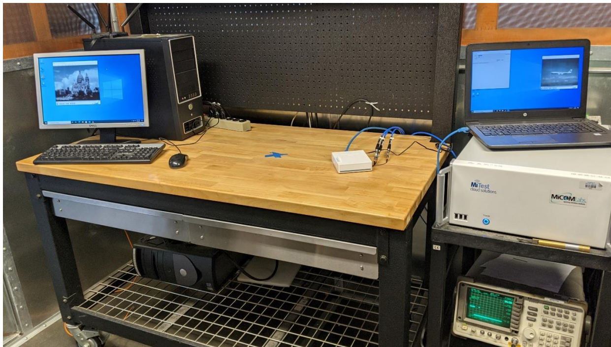
DFS Test setup