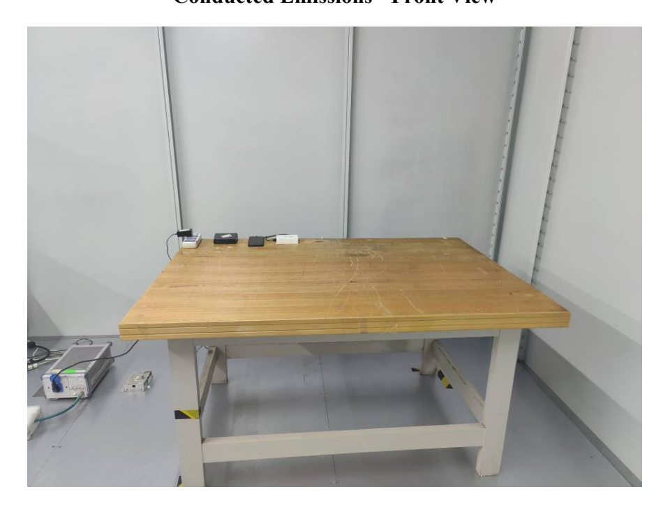
Conducted Emissions - Front View