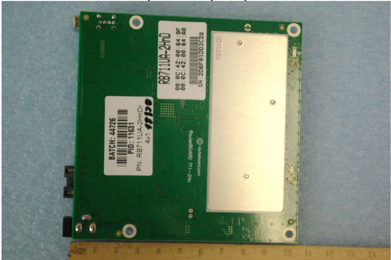
Back side of EUT PCB (heat sink in place – No components placed under heat sink)

Rogers Labs, Inc. 4405 W. 259th Terrace Louisburg, KS 66053 Phone/Fax: (913) 837-3214 Revision 1