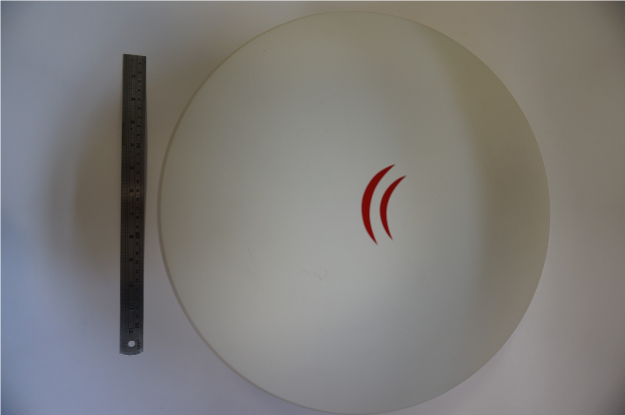
External photographs of equipment under test