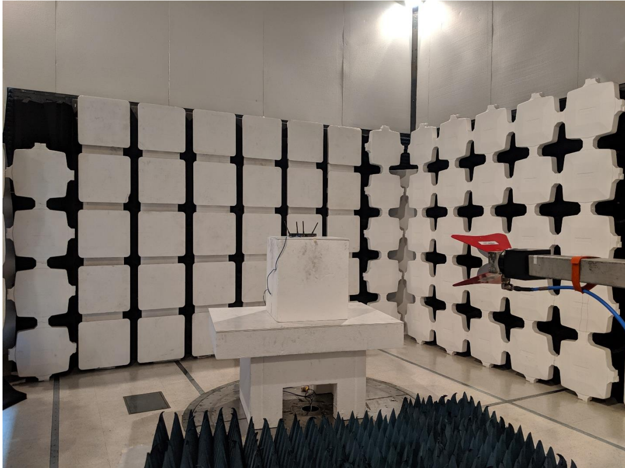
Radiated Transmitter Spurious Emissions Above 1GHz