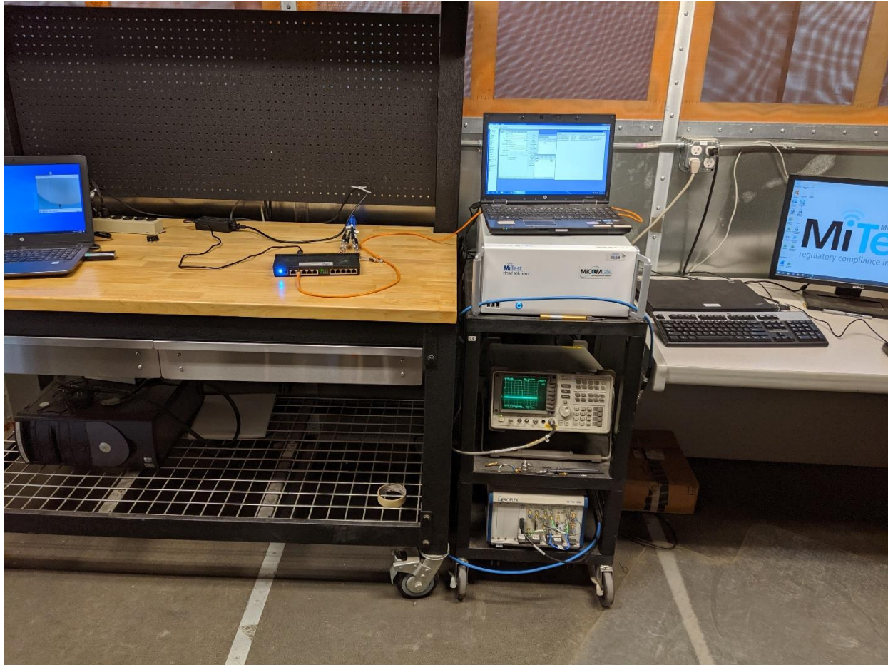
Conducted DFS Test setup