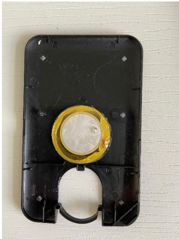
Back of plastic case