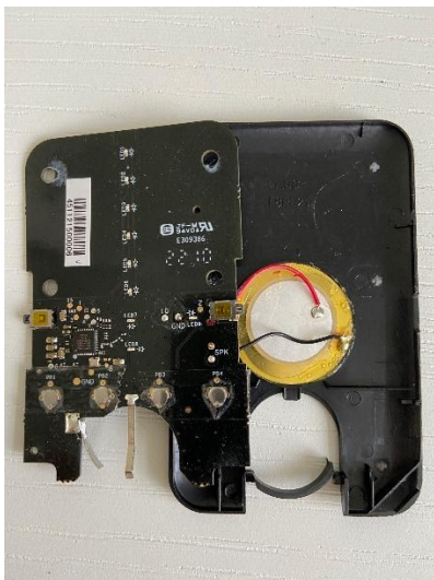
Front of PCB and back of plastic case