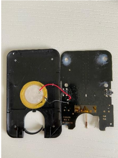
Back of PCB and back of plastic case