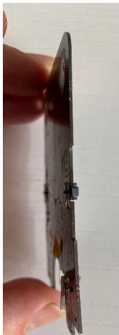
Right hand side of PCB