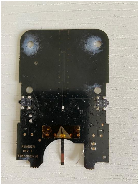
Front side of PCB