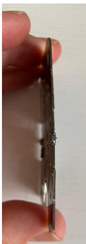
Left hand side of PCB