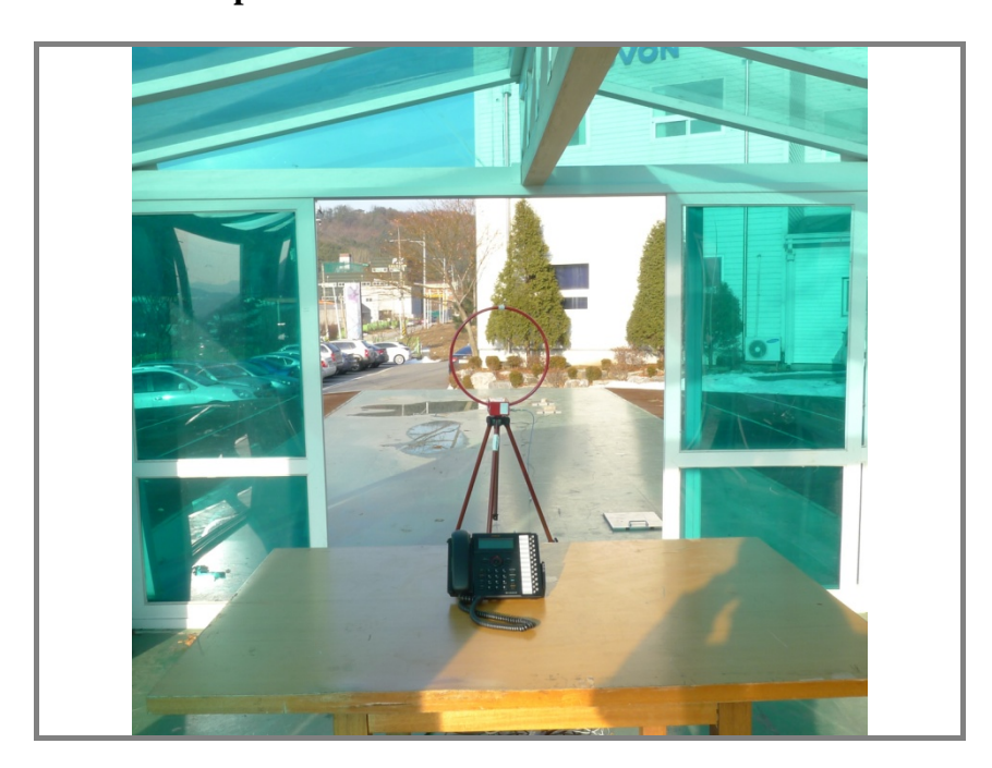
Photo of radiated spurious emission at 30 Mz \,\sim 1\,000\,\,\text{Mz}

Photo of radiated spurious emission at below 30 \mbox{\em Mz}