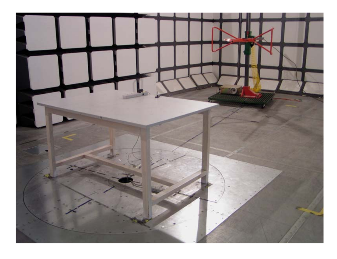
Radiated Emissions - Rear View for charging mode