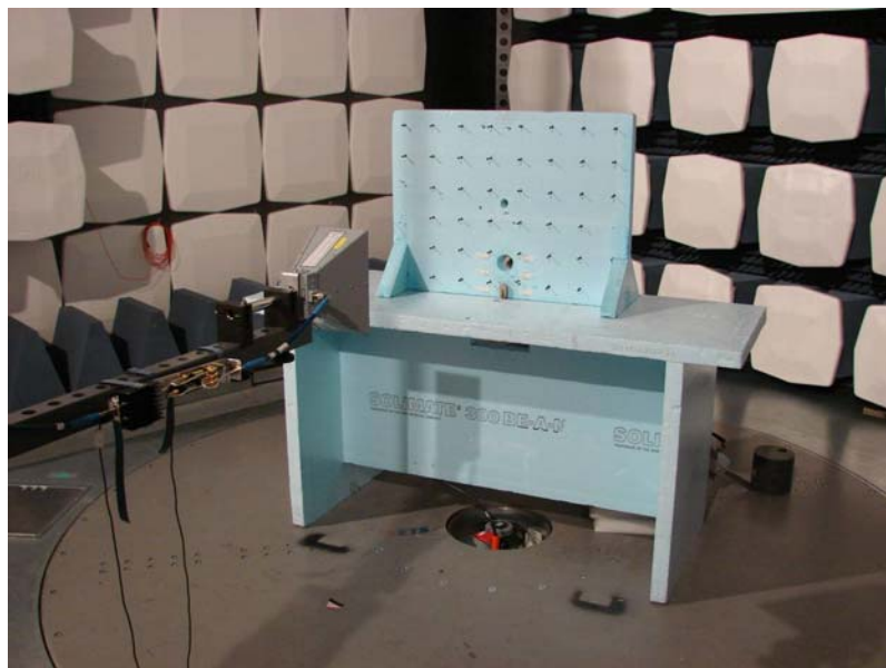
Picture 2: Radiated spurious emission measurement set-up for above 3 GHz measurements, EUT in vertical orientation