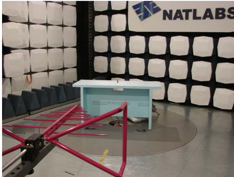
Picture 1: Radiated spurious emission measurement set-up for below 3 GHz measurements, EUT in vertical orientation