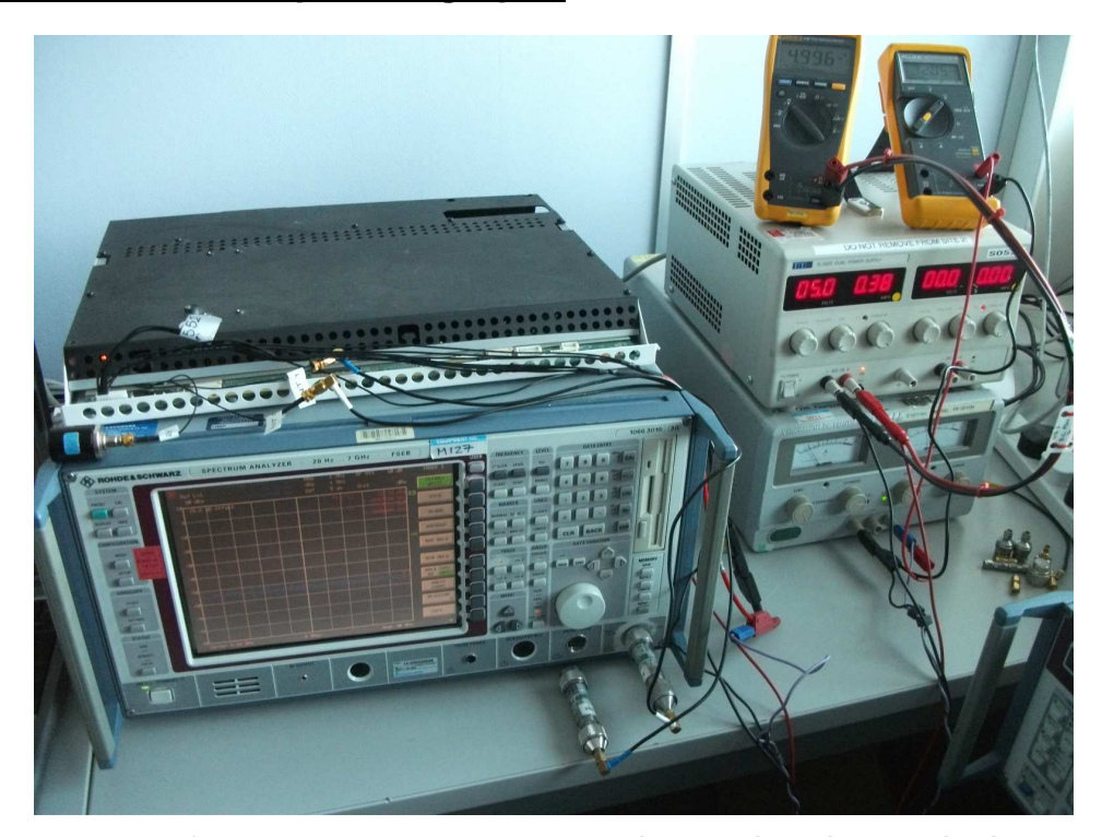
Photo #1. Test setup for conducted measurements on Video Engine. Video Engine is the black box on top of the spectrum analyser.