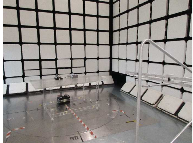
Radio-frequency radiated emissions 30MHz to 1GHz