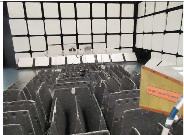
Radio-frequency radiated emissions 1GHz to 6GHz